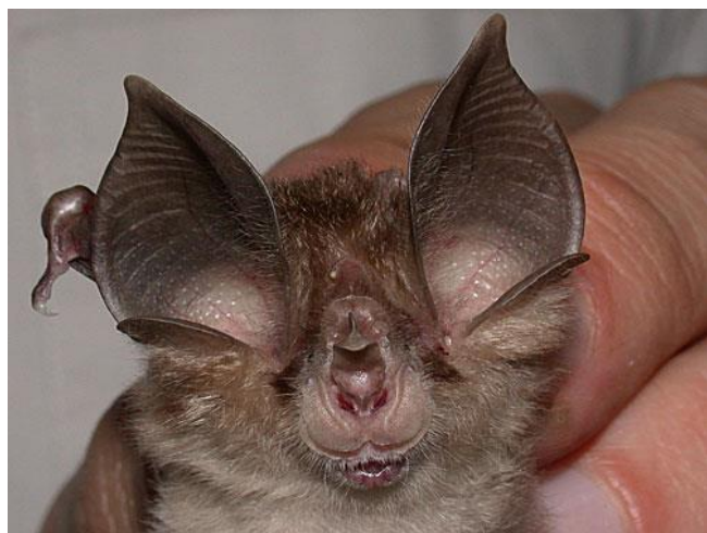
Fig. 2. Rhinolophus siamensis ( http://www.bio.bris.ac.uk/ )