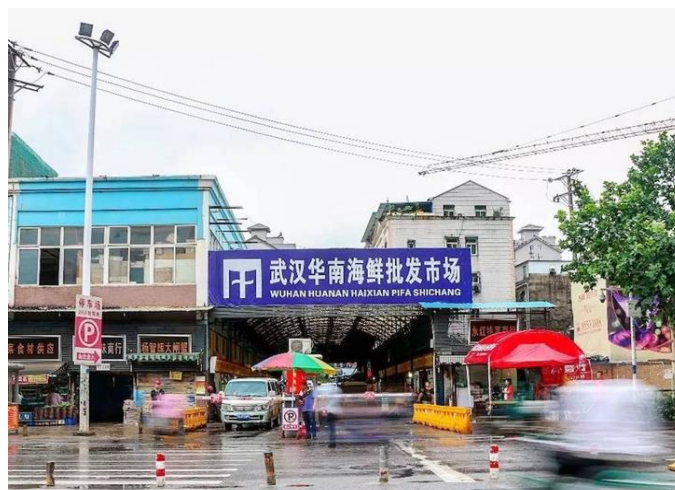
Fig. 3. Potential source of COVID-19