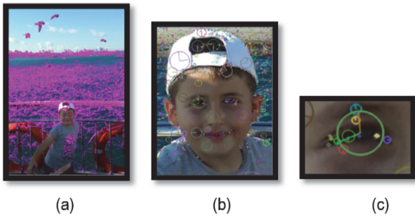
Figure 2 Display of SIFT keypoints

same but repetitive in different spatial domain at different angles as given in Tab. 1.