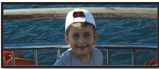
Figure 3 Non-repeating top 4 SIFT keypoints

In Fig. 3, four non-repeating keypoints from the top 5 SIFT keypoints are shown in red circles.