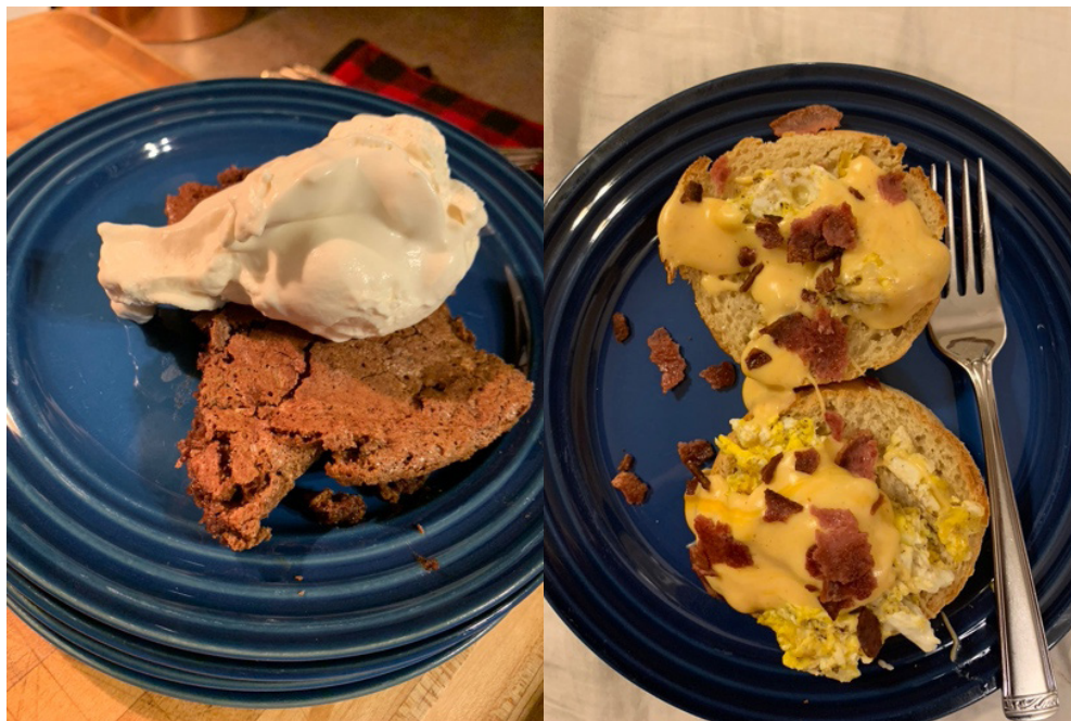
Figures 4 and 5. Images from Elizabeth of an elaborate dessert, (flourless chocolate cake and coffee ice cream) and breakfast (English muffins with eggs, cheese sauce, and bacon).

In addition to normalizing sheltering-in-place conditions with our families, we also strove to construct extraordinary experiences. From making elaborate food to doing unique family activities, we engaged in maternal identity work that reinforced positive impressions of our maternal roles to ourselves and our families. In terms of food, two of us, unbeknownst to each other, selected images of extravagant dishes we made for our family to show during the interactive interviews describing our desire to be good moms and make our homes special during the pandemic. Elizabeth displays images of food that she made, explaining, “I made us really elaborate meals.” Likewise, Sarah described making two versions of whoopie pies, one for her daughters and the other for her and her spouse (see Figures 4 and 5).