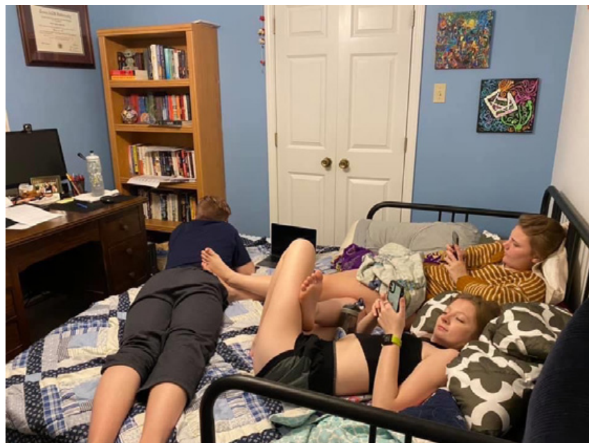
Figures 1 and 2. Heather's images of her Facebook post of the living room yoga setup and of her three kids all piled into her home office space, which her eldest daughter slept in while home from university.