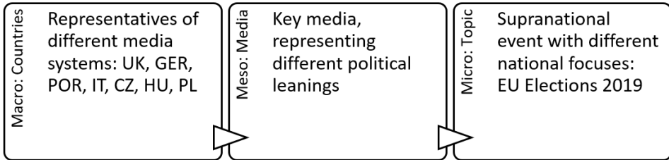
Figure 1: Levels of representativeness

Levels of representativeness and operationalisation at country, media and topic level