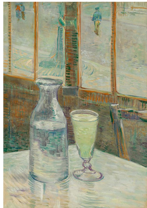
Fig. 2 Still life: Café table with absinthe (February/March 1887), Van Gogh Museum, Amsterdam, The Netherlands

Another suggestion was cycloid psychosis, characterized by confusion states, psychotic symptoms, mood swings, anxiety and psychomotor disturbances