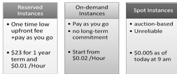
Figure 1. Pricing models

The Spot Price fluctuates based on supply and demand for instances, but customers will never pay more than the maximum price they have specified. If the Spot Price moves higher than a customer's maximum price, the customer's instance will be shut down by the cloud provider [9]. Figure 1 shows three pricing models.