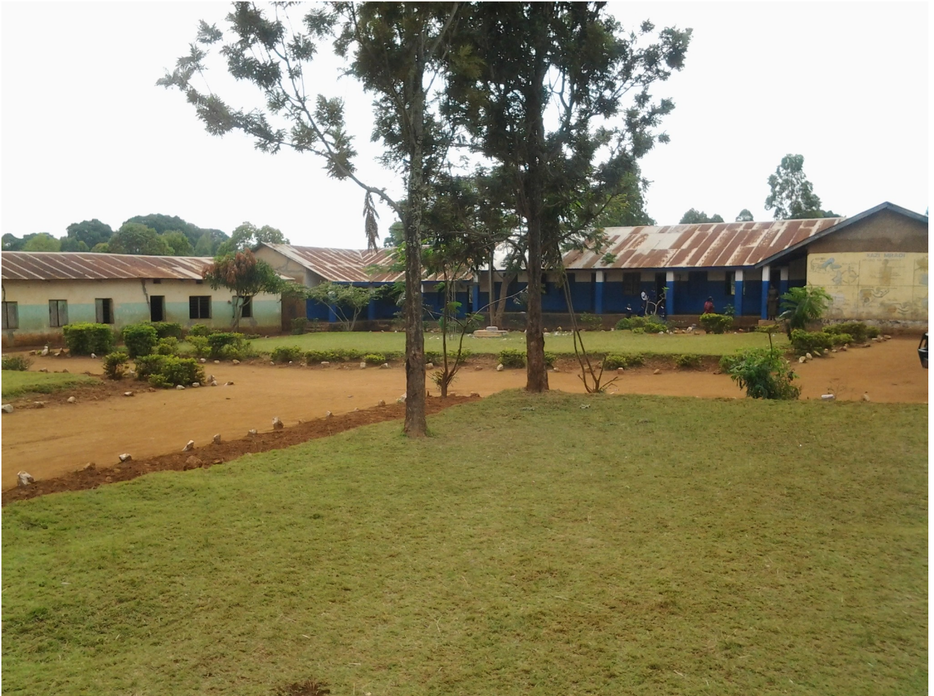
Fig 2. A picture of a primary school from Kagera region.

https://doi.org/10.1371/journal.pone.0242240.g002