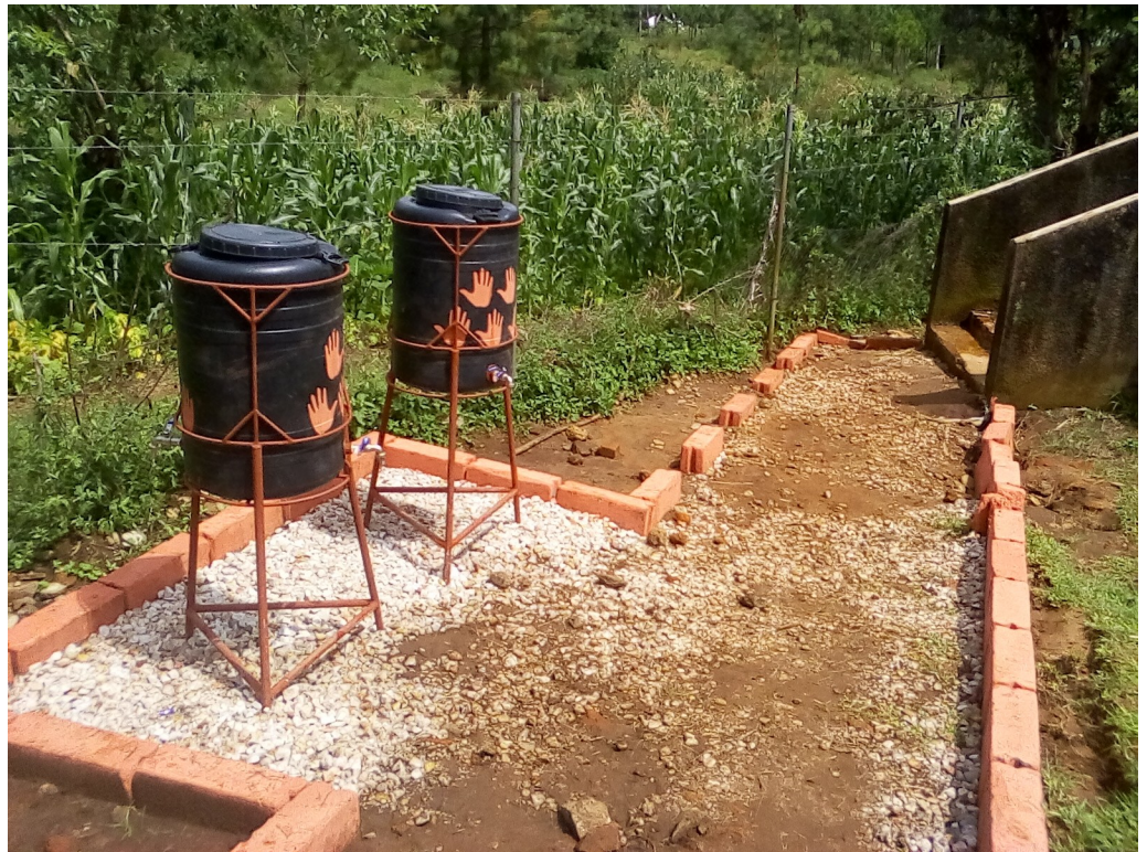
Fig 3. Handwashing facility with painted nudges from one intervention school.

https://doi.org/10.1371/journal.pone.0242240.g003