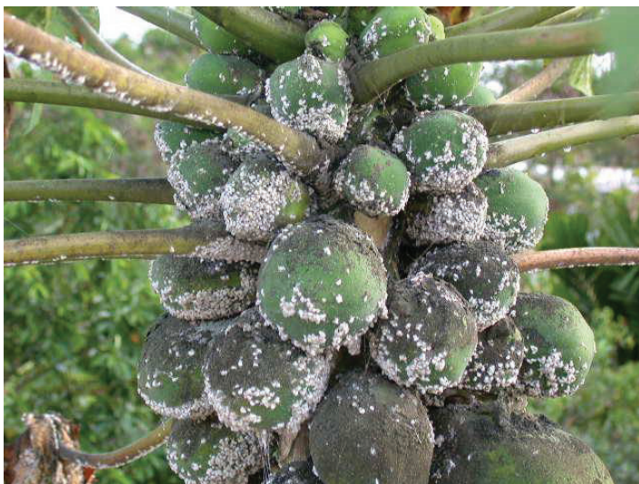
Figure 2. Papaya mealybug.

During these two phases, the IPM CRSP in collaboration with its national partners concentrated on identifying the major pest and disease problems of high value vegetable crops, developing management tactics, and transferring technologies to farmers to replace the use of chemical pesticides. To cite a couple of examples, to overcome the soil-borne bacterial wilt ( Ralstonia solanacearum ) of solanaceous crops, grafting on resistant rootstock, like wild eggplant, was adopted in Bangladesh. To manage the devastating tomato yellow leaf curl virus (TYLCV), the technology of a host-free period was introduced in Mali (Norton et al. , 2005; Heinrichs et al. , 2006).