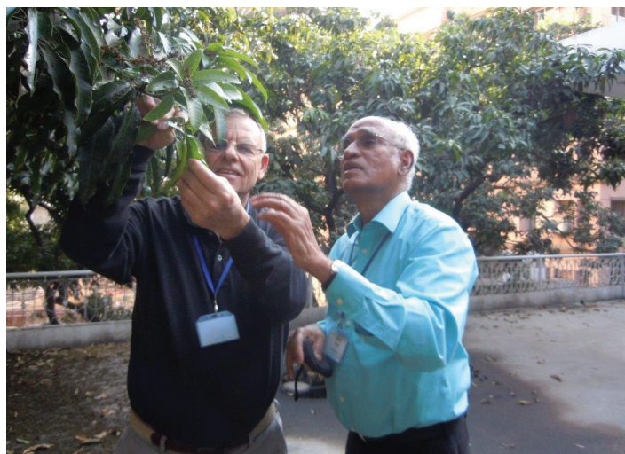
Figure 1. Examining mango leafhoppers in Bangladesh

The IPM concept emerged out of the adverse impact of pesticides on non-target organisms and the development of pesticide resistance in targeted pests in the 1960s. The U.S. Environmental Protection Agency and USDA nurtured IPM by supporting major ventures like the Huffaker and Adkison projects in the United States (Olsen et al. , 2003). USAID also supported Consortium for International Crop Protection (CICP) activities in developing countries during this time.