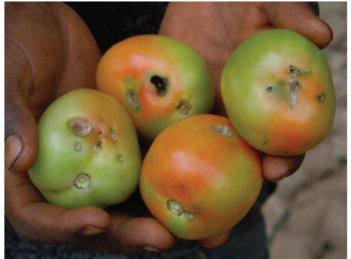
Figure 4. Tuta absoluta damaged tomato fruits.

areas, such as 1) the production and use of Trichoderma spp., Pseudomonas fluorescens , and Beauveria bassiana ; 2) virus diseases of vegetable crops; 3) papaya mealybug ( Paracoccus marginatus ) control; 4) grafting vegetable seedlings; 5) seed-borne diseases of vegetables; and 6) management of Tuta absoluta .