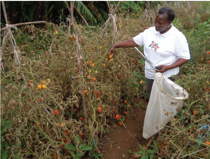
Figure 3. Tuta absoluta damaged tomato field in Kenya.