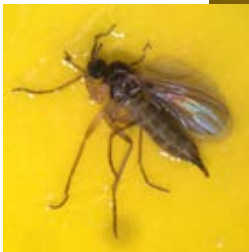
Fungus gnat, highly magnified

gnat infestation, the life cycle must be broken. This can be done by removing the fungus in which they breed, while simultaneously reducing the number of breeding and egg-laying adults. A non-chemical approach is to reduce the topsoil moisture by less frequent watering, drying out the soil and changing the plant medium to provide better drainage.