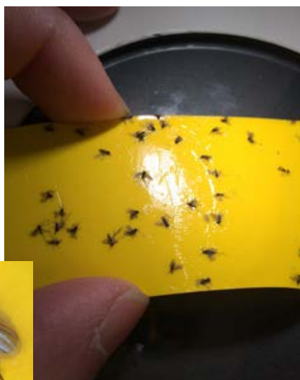
Fungus gnats on a sticky trap.