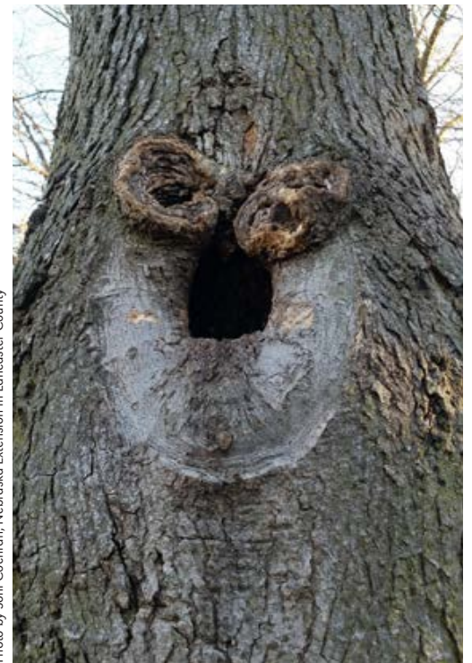
Trees which are living but have snag-like features like cavities also have important wildlife value.

water, snags are home to an abundance of wildlife. These animals are also sources of food for other wildlife who visit snags.