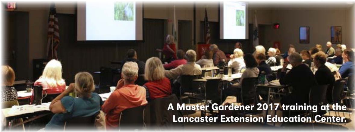
A Master Gardener 2017 training at the Lancaster Extension Education Center.