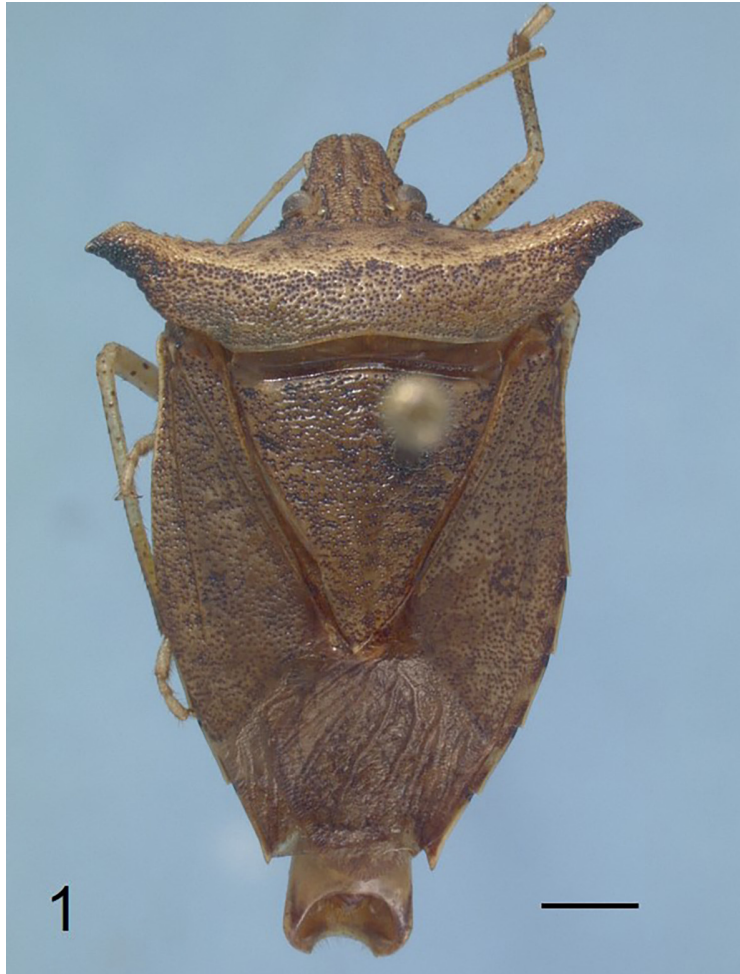
Figure 1. Euschistus (E.) baranowskii , habitus. Scale line = 1.0 mm.

pair of preapical tubercles, impressed below tubercles, transversely ridged above tubercles. Parameres somewhat ovate, flattened, bent laterally, thickened apically.