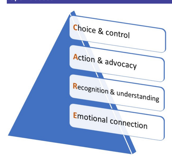
Figure 2 Care model.