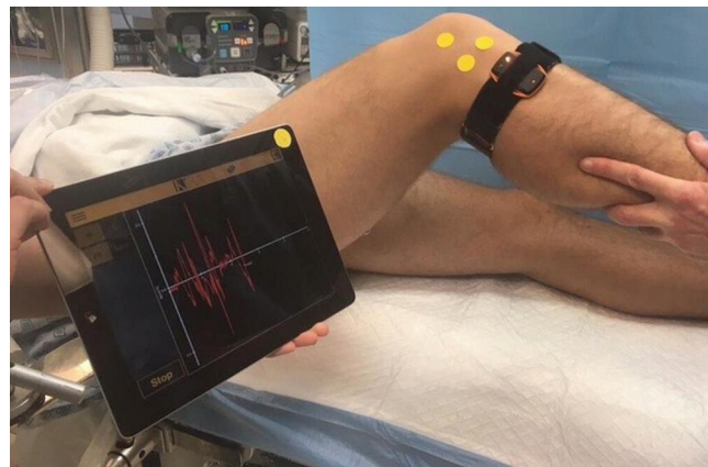
Figure 2 KiRa inertial sensor system for quantifying lateral tibial acceleration during the pivot-shift test.

solely rely on static AP translation since it fails to capture the more complex knee kinematics.