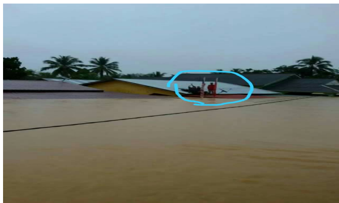
Figure 02. A picture shows a victim (blue circled) on the rooftop waving at a rescue boat