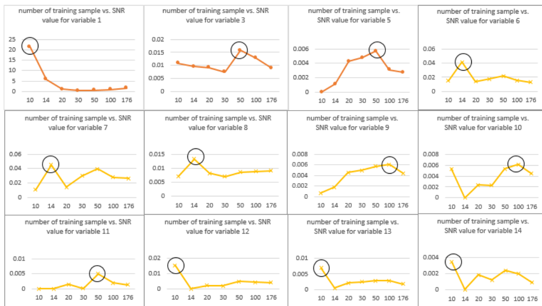
Figure 3. SNR weightage trend by the increment of sample data for respective variables

What can be highlighted in figure 3 is that the overall weightage SNR does not show significant differences except for the variables 1 for 10 samples, which indirectly shows that Taguchi's T-Method indeed can predict with an acceptable range of accuracy throughout the number of sample data considered with simple calculation procedures. There is a various study conducted recently in searching for a possibility to improve Taguchi's T-method prediction model accuracy and various findings been shared which proved to show that improvement is made and still have opportunity to be further enhanced [1], [2], [9], [11]–[16].