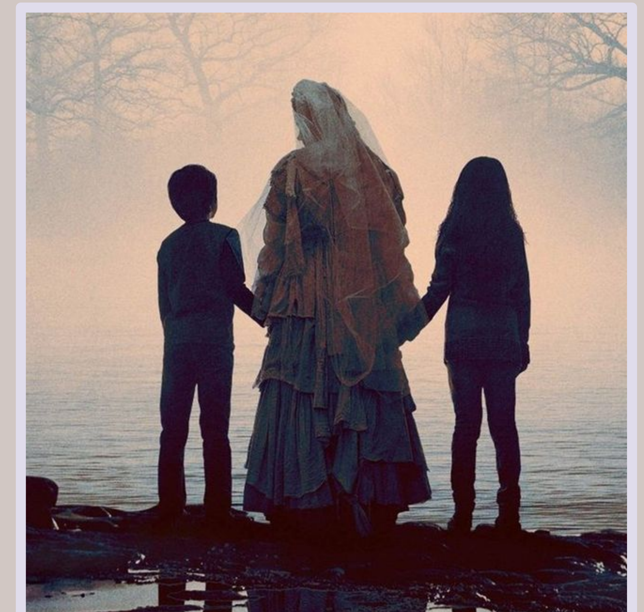
The Curse of La Llorona