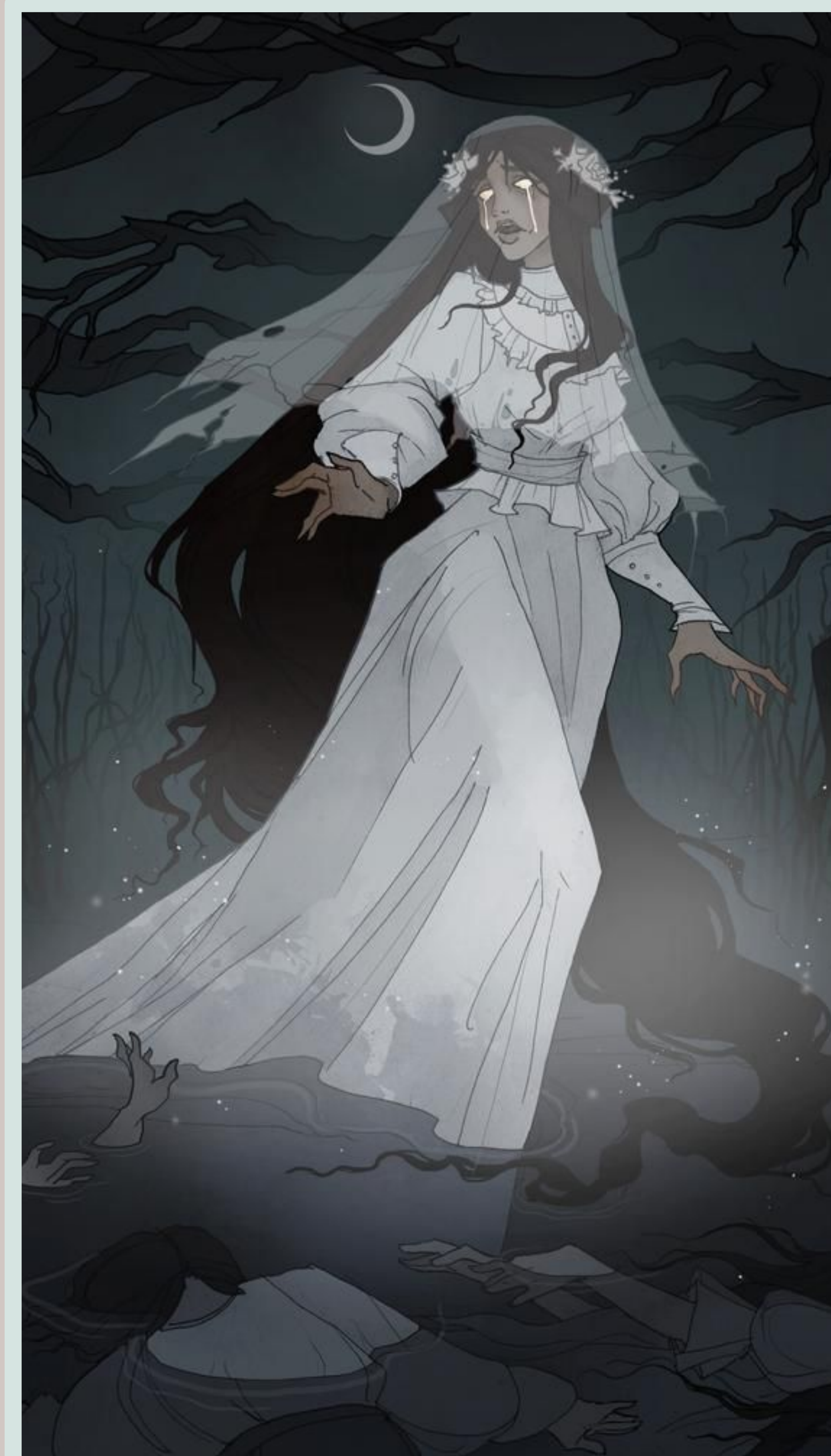
Drawing of La Llorona