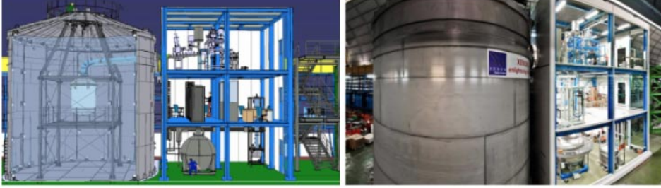
Fig. 2. – The XENON1T experiment: drawing of the experimental area (left) and picture (right).