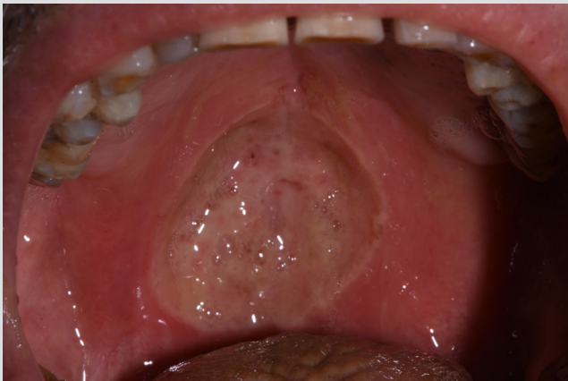
Figure 1. Initial photo, T 0

The first ozone session consisted of 5 applications of 2 minutes each, gradually increasing the power from 5 to 9. The insert utilized was the n #5 for mucosal use. The top of the probe in contact with the tissue released energy along the treated area. The ozone concentration was between 10 and 100 µg/ml. The patient felt pain during the first applications and the lesion was wetted with saline solution to reduce discomfort. At the end of the first session, the patient had already reported a reduction in pain, and he was able again to swallow and drink water. The patient returned after 2 days (T 1 ). The diameter and the depth of the lesion had decreased, the colour was more natural (a pinkish colour) and the oedema was reduced ( Fig. 2 ). After this second session, the production of saliva increased, the Candida infection was reduced and the patient stopped opioid intake, continuing with just ketoprofen once a day.