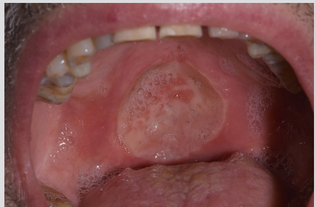
Figure 2. T 1 , 2 days after the first applications