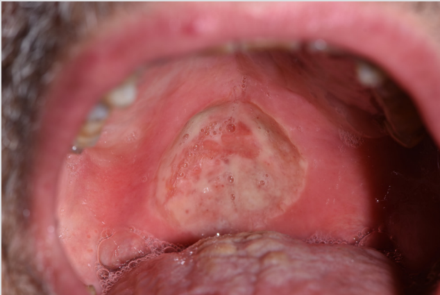
Figure 3. Four days after the first applications

The treatment continued with ozone applications (10 minutes each) every 2 days, using the mucosal and angled insert, alternatively, in order to also reach the deepest zone of the soft palate ( Fig. 3 and Fig. 4 ). Constant improvements were clinically appreciable and were noticed also by the patient. After 15 days, the lesion was remarkably reduced so doctors decided to restart the antitumoural therapy ( Fig. 5 ). After 22 days ( Fig. 6 ), the ozone treatment was ended after a last application of ozone gas with the same machine and ozonated water (2 cycles of 1.5 minutes using the Aquolab® Professional). After 1 month, the patient returned for monitoring of lesion healing ( Fig. 7 ).