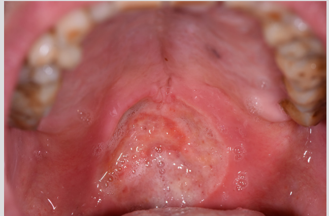
Figure 4. Eight days after the first applications