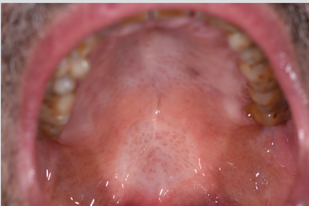
Figure 7. No treatment, follow-up 31 days after the first ozone applications