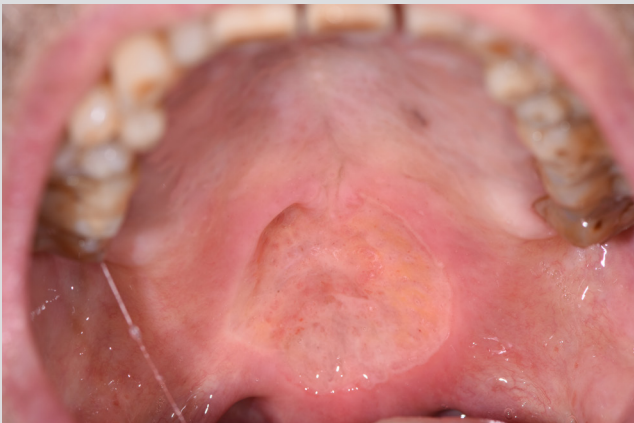
Figure 5. Fifteen days after the first applications