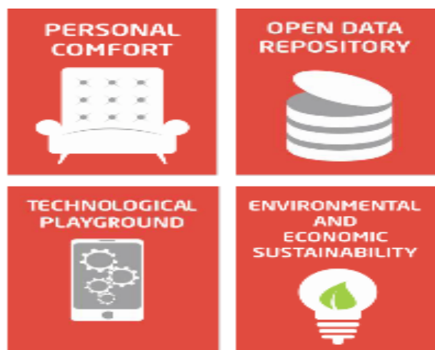
(Figure-1: Basic concepts to planning a modern Library)

Traditional libraries don't meet the changing needs on information provision of today's information society. Library buildings, which are planned on old norms and standards, do not satisfy today's situation. There are four basic concepts to planning a modern Library as mentioned in Figure-1 Summarizing all the above, some principles of modern library's activity and its architectural solutions can be formulated, which are as follows :