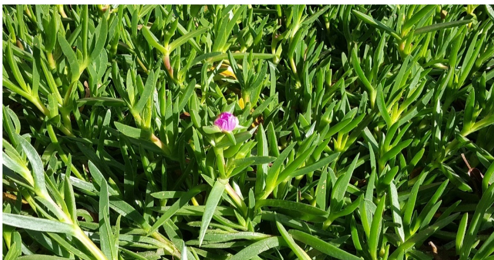
Figure 1. The flowering carpobrotus edulis plant and its taxonomy [2].

C. edulis is a mat-forming plant with bright green foliage and leaves that could have red, orange, or purple-coloured margins and surfaces [2] as shown in Figure 1 below. This plant reproduces both sexually and asexually, producing large flowers and fleshy indehiscent fruits that contain arrays of seeds. The plant grows by invading and colonizing the environment through its stolons, which spread along the soil surface yielding new ramets at every node for proper propagation [3]. C. edulis can be found on cliffs, coastal rocks, and dunes where it spreads widely, forming a creeping mat on the surface, displacing several other coastal flora [4] and negatively affecting species diversity [5–7]. Some European countries have prohibited the release of plants belonging to the Carpobrotus species to protected areas, mainly because of the invasiveness of this species [8].