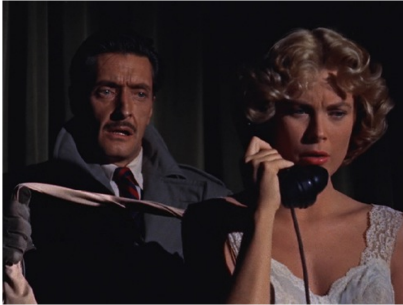
Fig. 5: From Dial M for Murder (dir. Alfred Hitchcock, 1954).

desires “which are multiple, contradictory, shifting, oscillating, inconsistent and fluid.” 15 Although these mechanisms also apply in the field of reading, visual spectacle particularly encourages this quality of identificatory mobility.