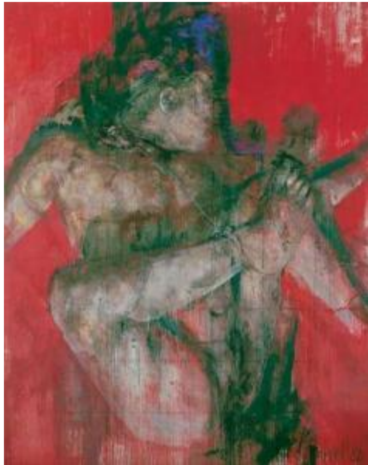
Fig. 11: Heike Ruschmeyer, Erlkönigs Tochter II (1986).

The aesthetic nature of Ruschmeyer’s “acrobats” effectively shows up, then, rather than mindlessly reproducing, the prurient voyeuristic relationship existing between the “ordinary viewer”—and in image culture, we are all ordinary viewers—and the spectacle of self-inflicted death-by-pleasure.