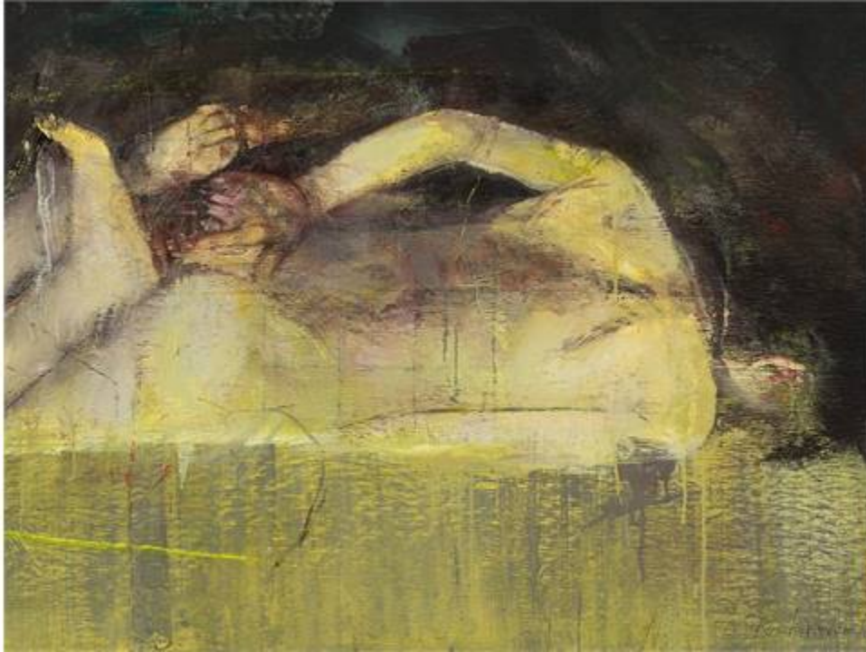
Fig. 10: Heike Ruschmeyer, Tischgebet (1986).

Such an argument, however, though perhaps generally tenable, misses the point with regard to the specificity of this collection of pictures. We have seen above the extent to which it is difficult to ascertain the mimetic, evidential or authorial status of the images of auto-erotic fatalities that litter forensic texts. More so than in the case of murders or regular suicides, the factor of self-representation and the series of complex wishful identifications engendered in the case of auto-erotic death images highlight particularly acutely the absence of any possibility of neutrality or absolute knowledge. Similarly, we have witnessed the sheen of glamour which the images progressively acquire as they are voyeuristically called upon to signify within the discursive processes of forensic science. These images already connote what Laura Mulvey in her seminal article—describing the woman’s body in cinema, rather than in the spectacle of death—calls “to-be-looked-at-ness.” 22