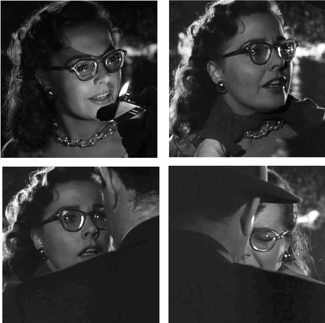
Fig. 7: From Strangers on a Train (dir. Alfred Hitchcock, 1951).

Cooper of suffering—may serve the ancillary but structurally determined aim of constructing a fixed narrative of meaning, an internal logic to the provocatively puzzling paraphilia. Yet this rigid retracing of a single rooted “cause” is, in fact, dynamically very different to the way in which Nelson describes experiencing his sexual enjoyment. When casting the agents and victims to star in his fantasy scenarios, Nelson Cooper crosses gender and generation, introducing an infinite variety of content into his iconographic structure. In this way—and surprisingly—his asphyxiophilic fantasies