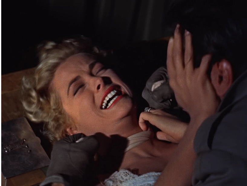
Fig. 6: From Dial M for Murder (dir. Alfred Hitchcock, 1954).

my favorite [. . .] This scene recurs most often in my fantasies, except that I substitute any girl I want for the original actress. I imagined that scene over and over again in my mind for at least three years. I thought it was a sensuous and beautiful death. (B 126)