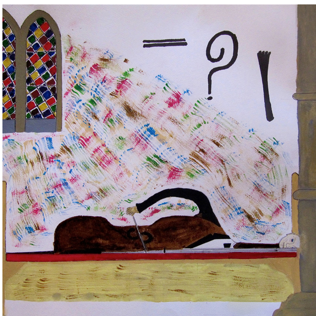
Figure 2 Painting by MDBD.

The rationale of HoS is to provide a safe space through the medium of arts in which group members have the opportunity to reconnect with their internal selves