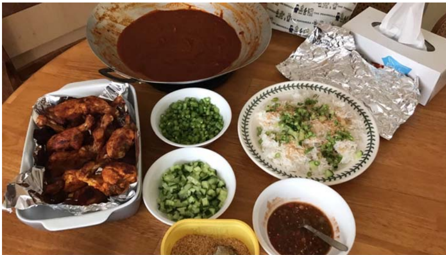
Plate A1. Farid's diner table – fried chicken for Farid is kept with rice and spicy curry