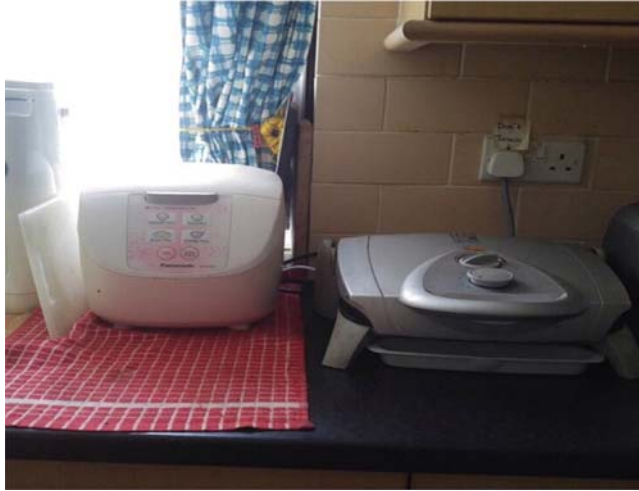
Plate A2. Farid's house has got rice cooker and grilled machine next to each other