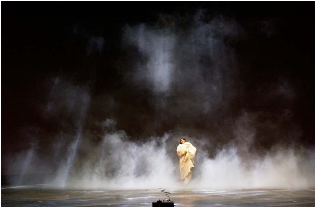
Figure 3. Ivanov , scenography by Katrin Brack, premiered at Berlin Volksbühne, 19 March 2005.

use of single materials – fog, foam, snow, confetti, balloons. 4 The use of stage fog as a special effect is common, but Brack’s filling the space continuum with dense and uncontrollable fog throughout ( Ivanov , Berlin Volksbühne, 2005) alters conditions, making the fog a performer, so to speak, thus requiring the actors to improvise with the material spatial atmosphere, the ‘weather’ conditions as they evolved and changed, hovering, drifting.