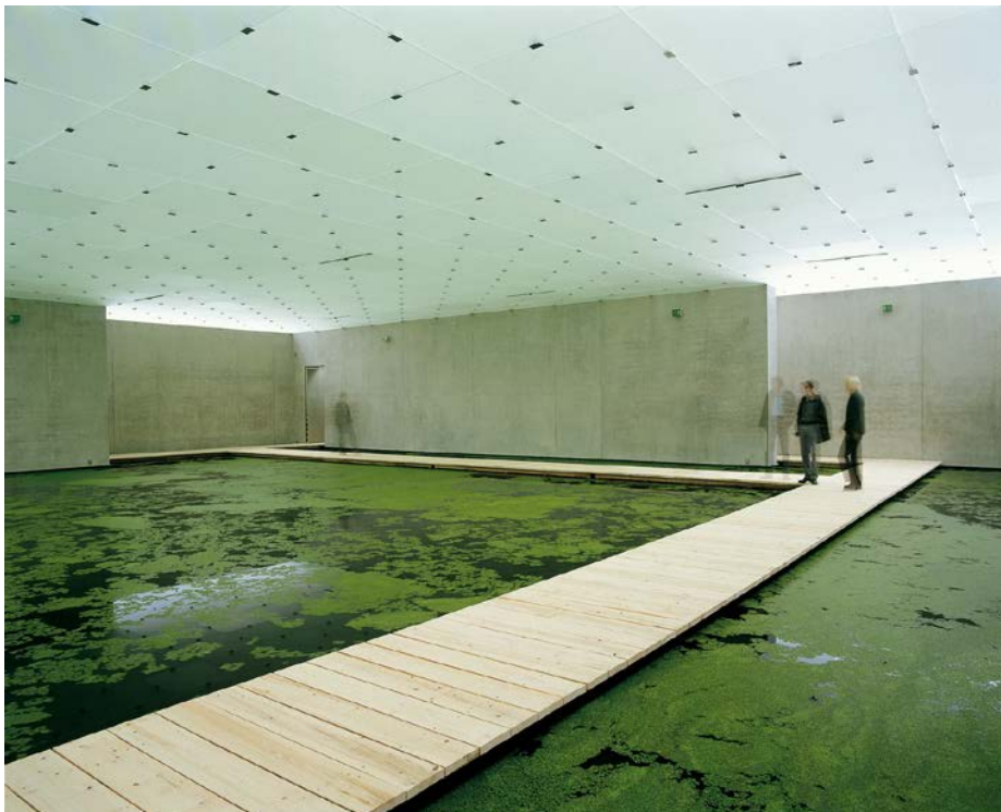
Figure 2. Olafur Eliasson and Günther Vogt, The mediated motion , 2001. Water, wood, compressed soil, fog machine, metal, plastic sheet, duckweed ( Lemna minor ), and shiitake mushrooms ( Lentinula edodes ) Installation view: Kunsthaus Bregenz, Austria, 2001. Photo: Markus Tretter © 2001 Olafur Eliasson

resonances that can link to metaphysical concepts such as the ecstatic; Böhme suggests that ecstatic materialities adhere to properties of things , and vibrant matter emerges along with what actors do or designers fill the stage with (1995: 33). There are many examples (in the European context at least since Appia, Craig, and Piscator) of theatrical spaces filled with tensions, their intensity contours tuned with uncanny, unnerving or soothing affect, with compelling rhythms, presences. Scenographic exhibitions at the Prague Quadrennial have revealed such affective tonalities in works of designers who do not just build sets. Installations such as Tomás Saraceno's Biospheres or Olafur Eliasson's Mediated Motion or The Weather Project have drawn special