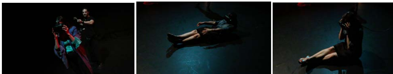
Figure 8. Visitor enacting/embodying what she perceives inside ‘Lemurs’ interface with VIVE goggles, conducted by Doros Polydorou, kimosphere no. 4. , 2017

architecture to costumes: the insides-outsides or ‘interskins’ as Haein Song, one of our dancers, called them).