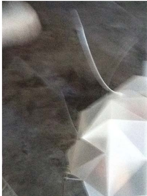
'Kepler', sound object, designed by Michèle Danjoux, DAP-Lab 2015