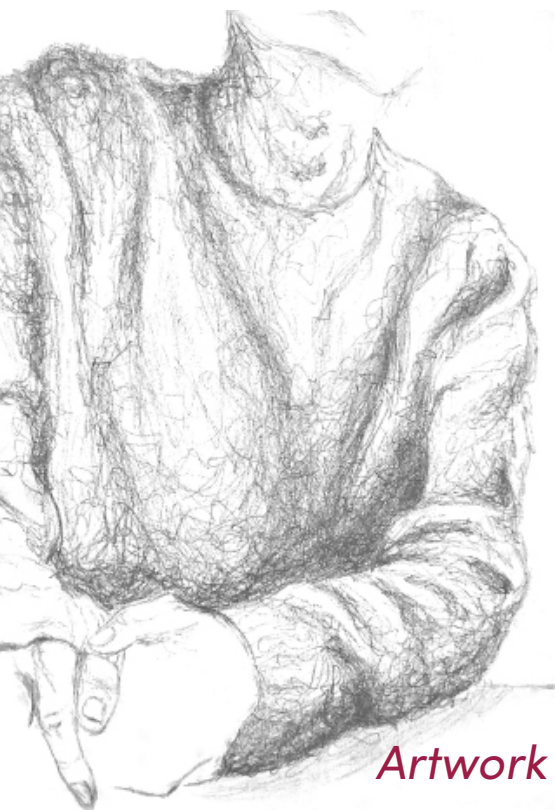
Artwork by Claire Riddell

The Diamond Line Literary Magazine has been typeset and designed using Adobe InDesign 2020. Work titles and text are in 24-, 11- and 12-point Sofia Pro font. Author names are in 14-point Sofia Pro font. Cover title is in 57-point Sofia Pro font. Cover subheadings are in 14-point Sofia Pro font. Page numbers are in 12-point Sofia Pro font. Spread designs were done by editors and members of the staff.