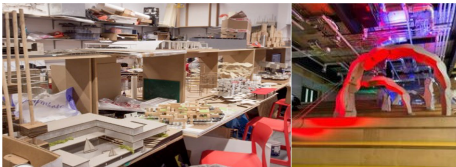
Fig. 1 Illustration of Here East fabrication and making spaces

The course learning is embedded within the London Olympic Park site Here-East equipped with a state-of-the-art fabrication resource including structural, material and