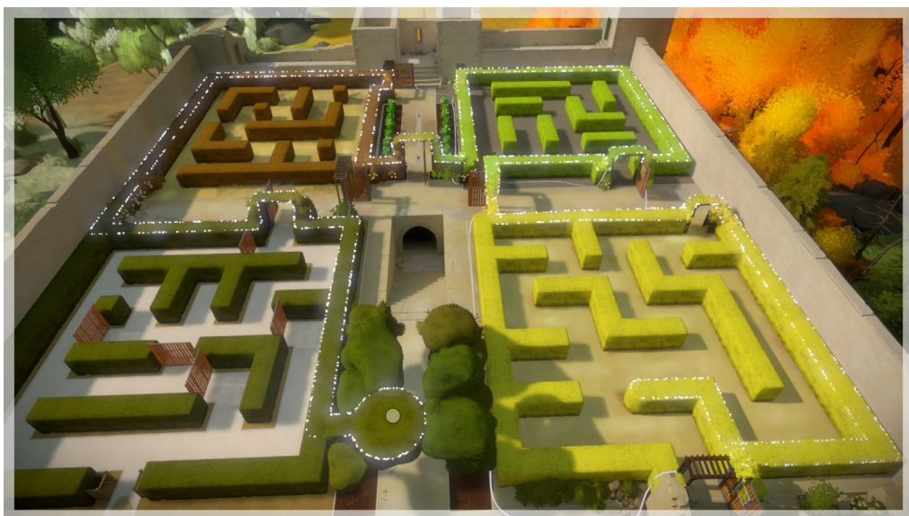
Figure 5: The Witness 's meta-puzzle in the "Keep" region.

All types of puzzles are combined in a section entitled 'The Keep', a tower surrounded by hedge mazes and derelict courtyards, and it is here that The Witness 's particular approach to multistability and cognitive mapping becomes fully tangible. When crossing the labyrinth initially, the player has to understand that there are additional conceptual walls to the (virtually) physically present ones. The gameworld communicates these invisible barriers as physical in a certain sense, e.g. by altering the sound of the avatar's footsteps to signify that they are stepping on a different surface. Upon repetition, the player understands that this sound acts as an aural signifier for a prohibited path. If we were to frame this in terms of multistability – the changed footstep sounds are perceived initially as incidental or atmospheric, before the player understands that they are actually symbolic; the multistability encountered here is therefore not one of the interpretative outcome, but of interpretative method – it would be a multi-sensorial kind in which the visual, the sonic, and the haptic feedback provided by the gameworld (the latter in the form of hit-boxes of shrubbery impeding the avatar's motion) are added when creating the cognitive map of the environment (see Figure 5).