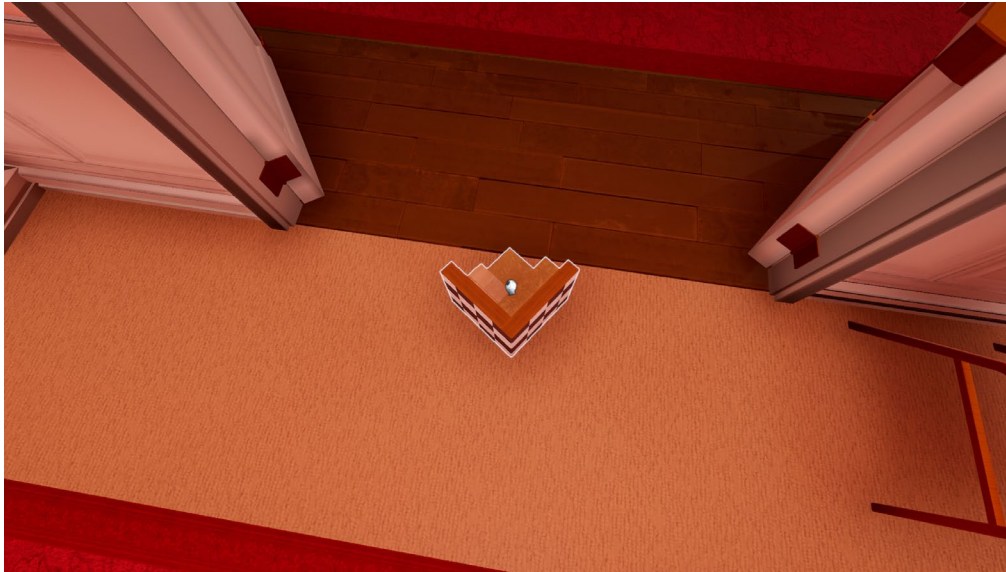
Figure 2: The Superliminal cube revealed as an open staircase.