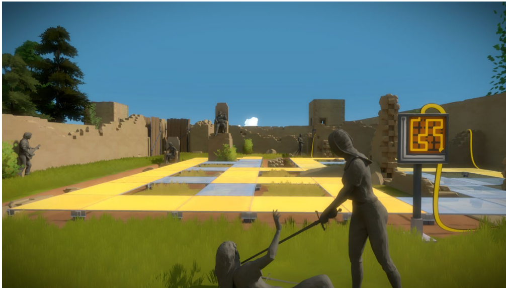
Figure 3: An intradiegetic puzzle interface in The Witness (far right) and its manifestation in the gameworld (background center)

demarcating regions, or drawing specific shapes. The significance of solving puzzles also varies; while most simply unlock progress to the next puzzle, a door, and eventually a key of sorts that grants access to the final challenges, some puzzles create paths for the player to walk on, i.e. they transform the gameworld itself (see Figure 3, background).