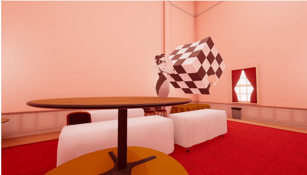
Figure 1: The table-and-cube trompe-l'oeil in Superliminal .

One exemplary transformation that foregrounds the centrality of perspective happens early on in the level “Optical”. At the end of a corridor is a step too high for the player to climb. Through a doorway to the right there is a room with a black-and-white painting in the far corner, appearing as a heavily distorted checkered cube with a missing piece in the bottom-right. Even when finding the perfect angle from which the distortion disappears, the cube does not transform into a solid object like objects encountered before. It first needs to be completed with the missing piece, which is accomplished by discovering a second trompe-l'oeil arrangement in the room, to be perceived from a completely different angle, which creates a table with a black-and-white vase on it to complete the cube (see Figure 1).