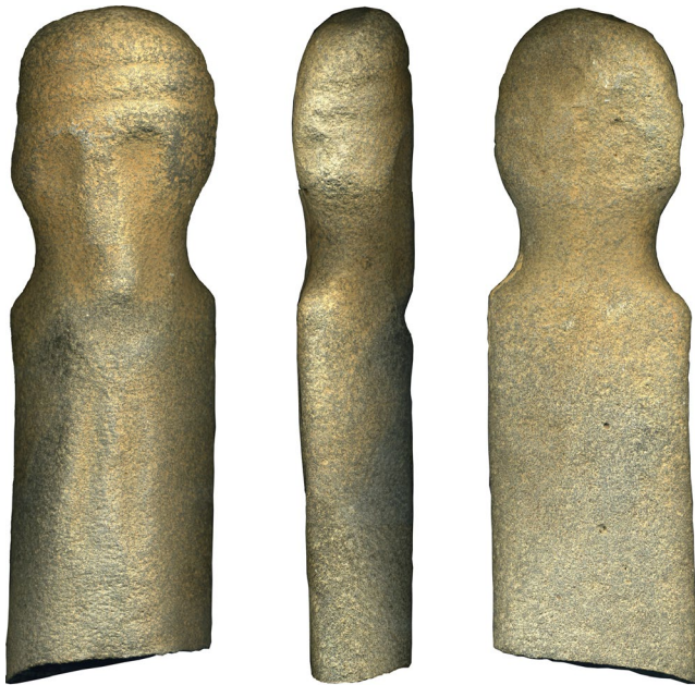
FIGURE 1 Wadi Sahab al-Asmar 8 north of Jabal at-Tubaiq, southeastern badia . Human representation (height: 35 cm, columnar basalt) found in the rubble of multi-chambered D-shaped cairn of the Rajajil Cultures (either late fifth/early fourth millennium BCE or—for its stylistic features—“recycled” Neolithic statue). [Colour figure can be viewed at wileyonlinelibrary.com ]

The inland fringes beyond Arabia’s coastal strips, where rich marine sources allowed productive shell-fishing/fishing, as well as productive hunter-gatherer cultures in the semi-arid fringes of the Fertile Crescent’s settled zones, were contact areas with Arabia’s inland hunter-gatherers. For example, in the badia , recent research by Abu-Azizeh and by Rollefson et al. may show evidence for such contacts with indigenous foraging cultures (Abu-Azizeh, 2019, Abu-Azizeh et al., forthcoming; Rollefson, Rowan, & Wasse, 2014: 299).