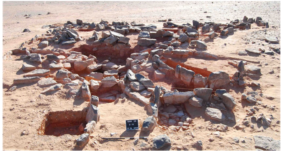
FIGURE 5 Qulban Beni Murra north Jabal at-Tubaiq, southeastern badia . Canal-type trough system fed by a well typical for the pastoral Rajajil Cultures (late fifth millennium BCE). (Eastern Jafr Archaeological Project; photo: H. G. K. Gebel; plan: C. Purschwitz) [Colour figure can be viewed at wileyonlinelibrary.com ]