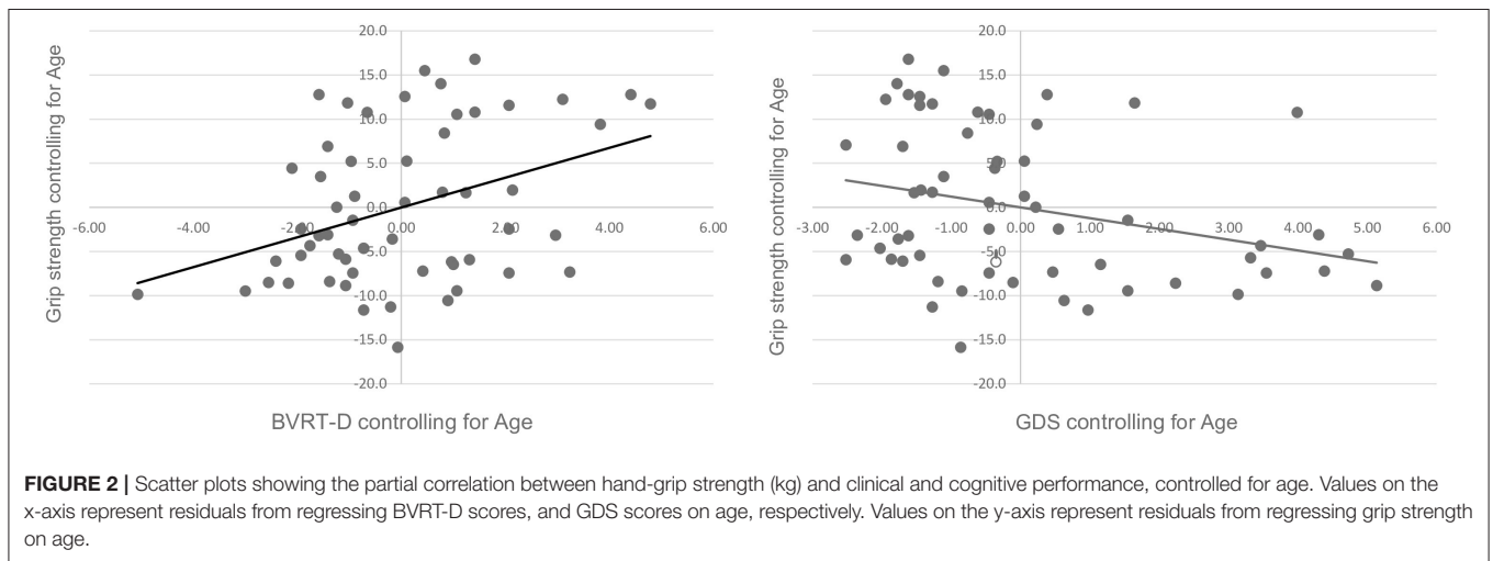
FIGURE 2 | Scatter plots showing the partial correlation between hand-grip strength (kg) and clinical and cognitive performance, controlled for age. Values on the x-axis represent residuals from regressing BVRT-D scores, and GDS scores on age, respectively. Values on the y-axis represent residuals from regressing grip strength on age.

The poor performance on the BVRT, which assess episodic visual memory, reveals potential different patterns of visual scanning and fixation in the prefrail participants. Poorer performances (longer times) in the TMT-B may suggest problems in divided attention and cognitive shifting in prefrail participants. However, this difference was not significant after