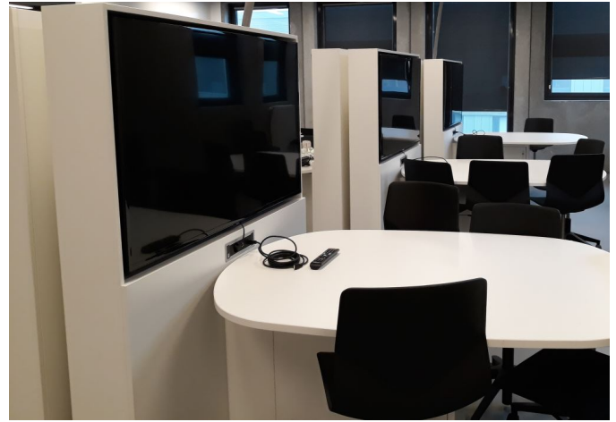
Fig. 3. Interactive poster session room