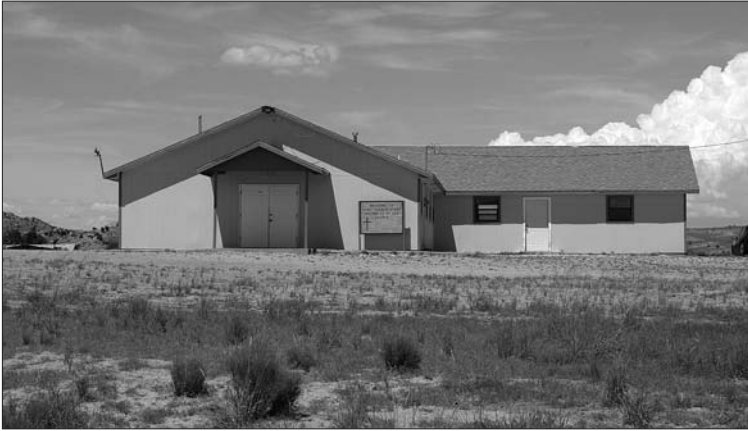
Photograph by Author, 2008