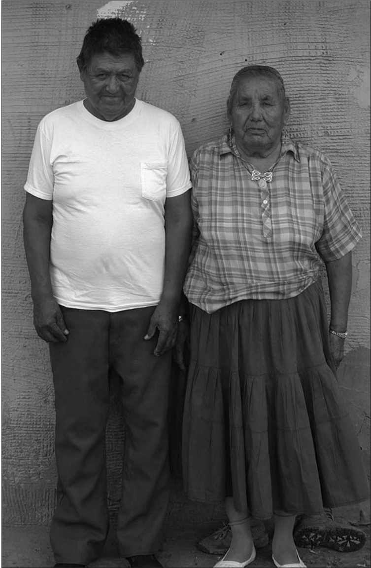
Photograph by Author, 2008