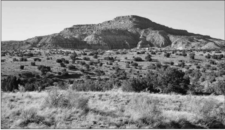
Photograph by Author, 2011