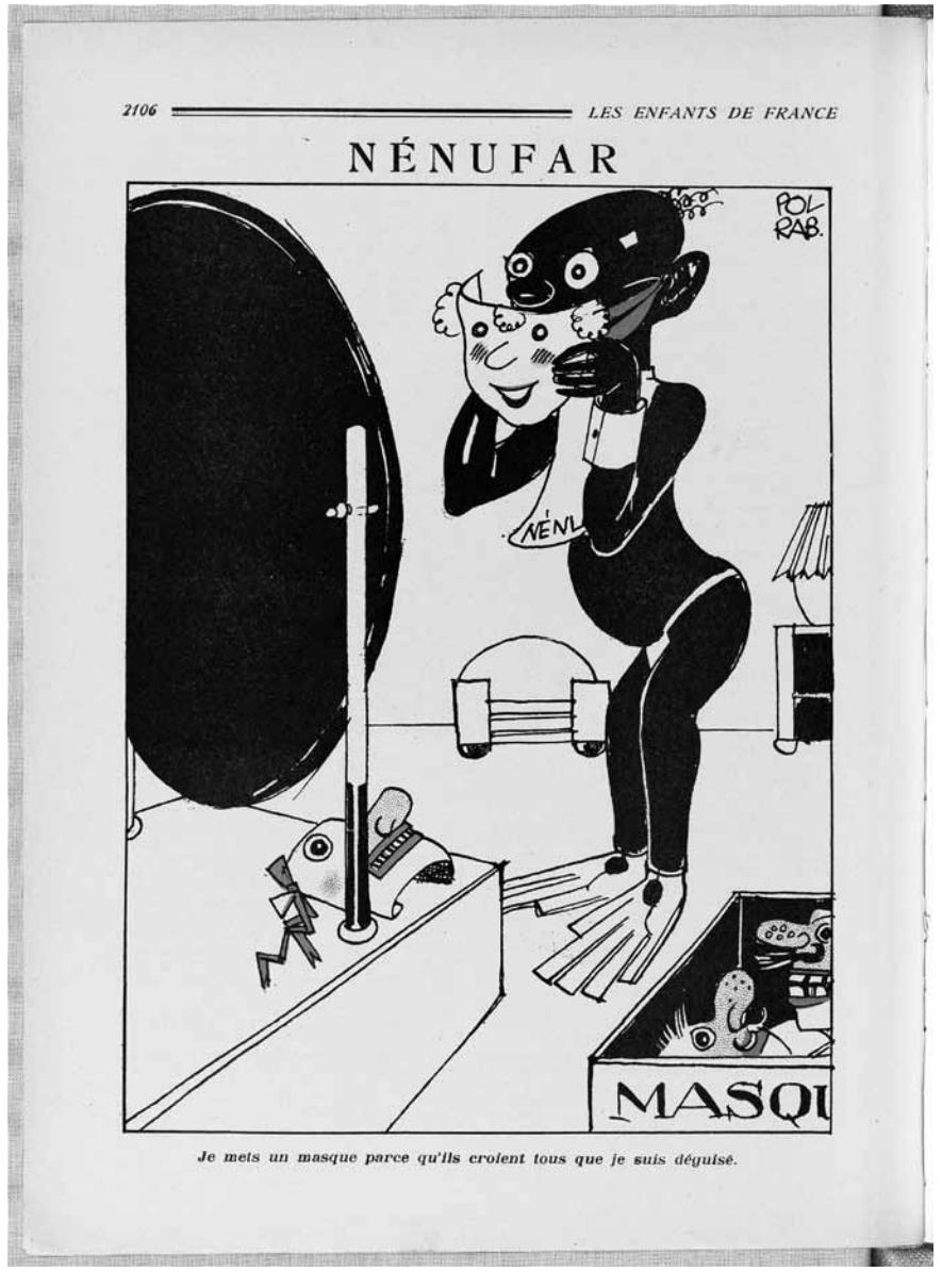
Figure 2: Illustration of Nénufar dressing up by Pol Rab in Les Enfants de France (1931).