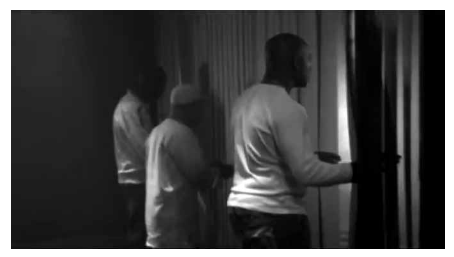
Figure 7: 'Nou Pas Bouger' artists Salif Keïta and L'Skadrille parting the hanging strips as the camera pans right.