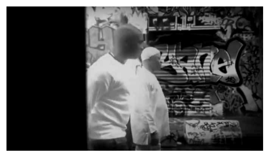
Figure 8: Camera continues its pan to reveal artists emerging from the strips into a graffiti-lined street.

closely by a multiethnic crowd) walk down a colorful, graffiti-lined street. The group's measured, steady pace suggests progress. During this hopeful march, however, the camera continues to pan to the right, and just as the camera captures the group head-on, the image begins to