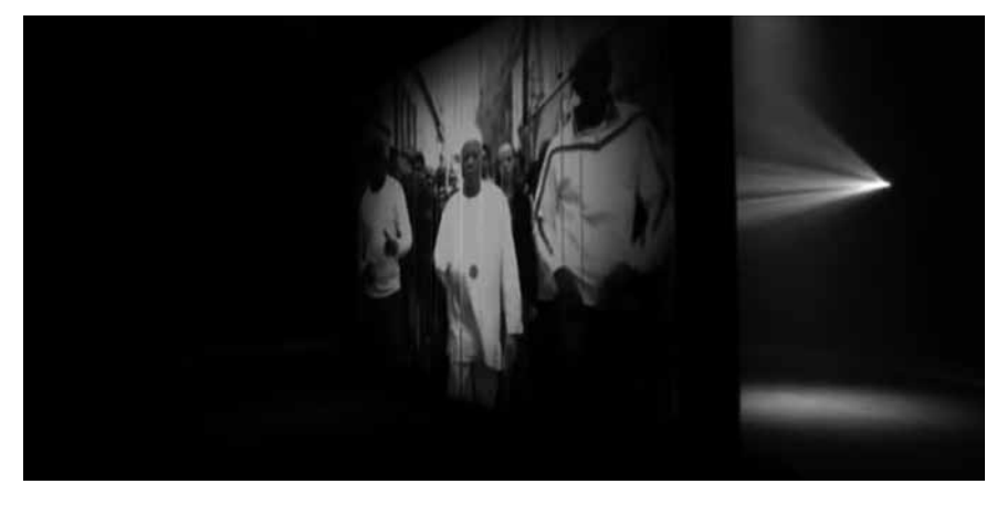
Figure 9: Camera continues pan as music video's final shot reveals scene from Figure 8 projected onto hanging strips.

fracture, the color becomes less saturated, and what was presented as one unified image dissolves as the hanging strips return to disrupt the image. Still without any discernible cuts, the camera continues its pan to capture both the image of the crowd marching, now projected on the hanging strips, and a projector behind the scene, before the screen suddenly goes black and the video concludes (Figure 9).