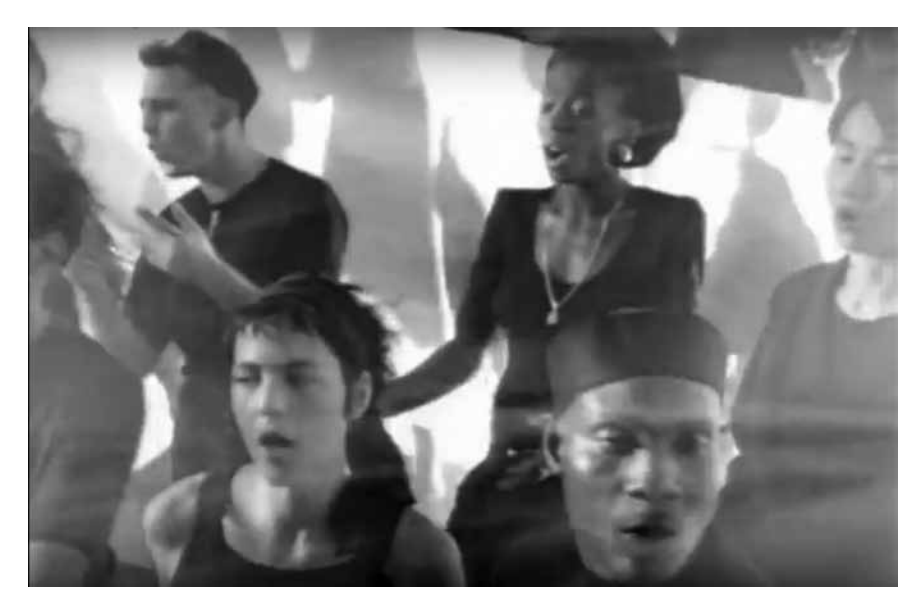
Figure 5: Multi-ethnic chorus in Keïta's 1989 version of 'Nou Pas Bouger', directed by Michael Meyer of Wonder Products.

surface, this scene's chromatic binary between black and white seems to mirror the way in which France's immigration debates were figured in implicitly (and sometimes explicitly) racial terms: the chorus's all-black attire stands out sharply against the white background and fabric, as do the shadows cast back onto the fabric. The lighting, however, reduces the overall contrast, and can be read as a critique of the larger discourse surrounding the immigration 'crisis': though it had been framed in very clear, oppositional terms—that is, depicted as a question of 'black' and 'white'—in reality, the video suggests that the debate needed far greater nuance. In this way, the 'Nou Pas Bouger' video anticipates the sans-papiers protest, which Rosello describes as a 'new authoring principle, a group of individuals who managed to impose a new grid of intelligibility, and to suggest that a much more nuanced response to their fate was both desirable and possible'.<sup>52</sup>