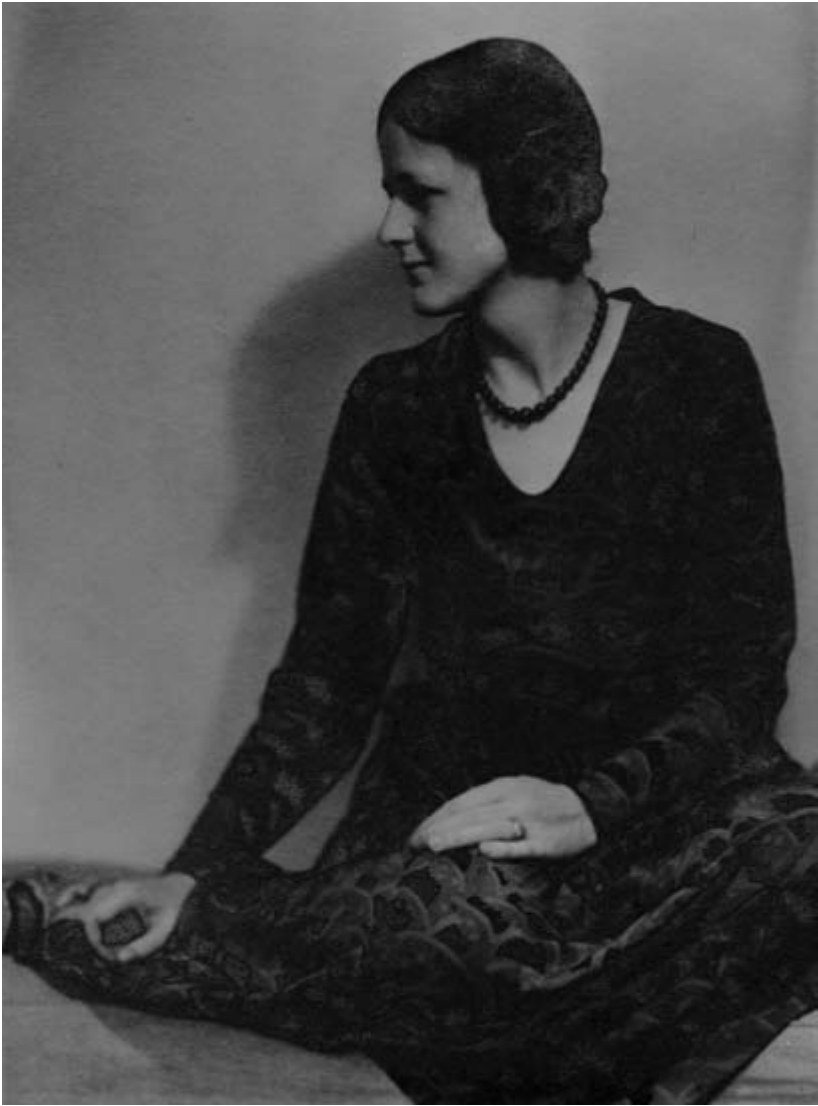
Joan Robinson.