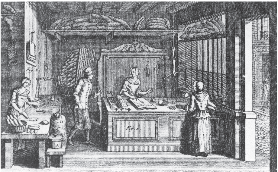
Illustration 7. Bakeshop. Note devices for sale on credit: the “tailles” in the hand of the baker-boy and the register kept by the baker’s wife. Encyclopédie .