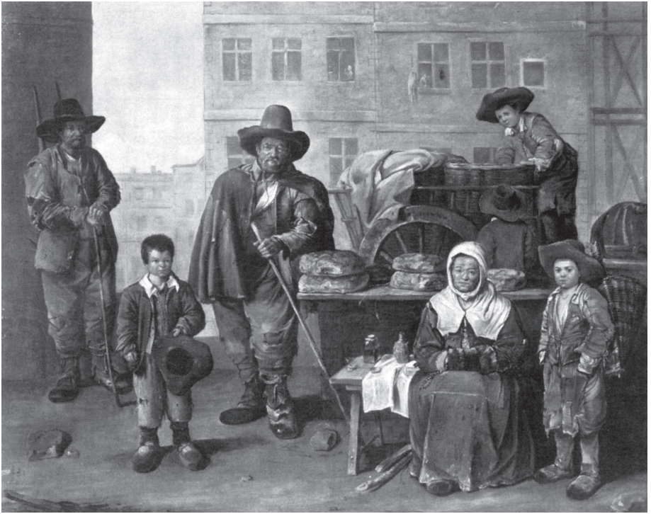
Illustration 2. “Foreign” baker supplying the twice-weekly bread market. The Baker’s Cart by Jean Michelin (1656). The Metropolitan Museum of Art, Fletcher Fund, 1927.