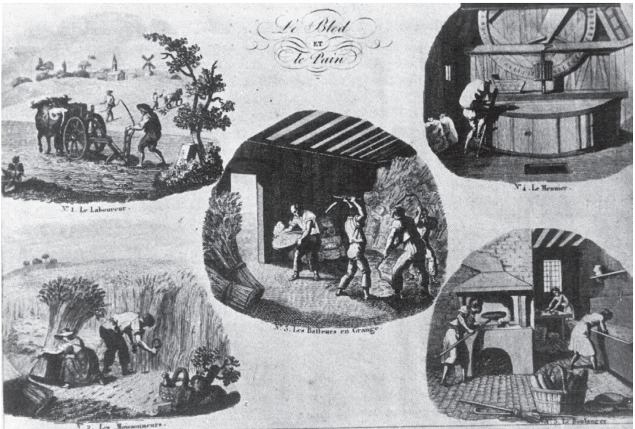
Illustration 6. Grain and Bread: 1. farmer. 2. harvesters. 3. threshers. 4. miller. 5. baker. Deutsches Brotmuseum, Ulm/Donau.