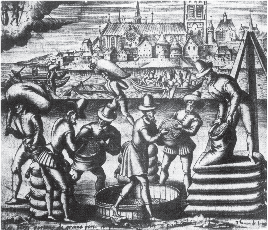
Illustration 5. Officials supervising the reception and sale of grain at the Paris ports, Grands Moulins de Paris.