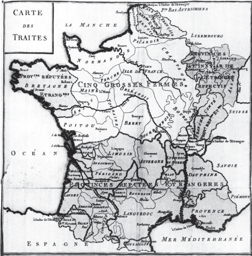
Illustration 1. Map of France in the eighteenth century showing provinces and customs divisions. Necker, Compte-rendu (Paris, 1781).