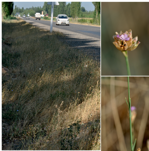
Figure 3. Petrorhagia prolifera (L.) P.W.Ball & Heywood, roadside, ca. 6 km S of Jalalabad in Kyrgyzstan, July 2016, phot. M. Nobis.

The genus Petrorhagia (Ser. ex DC.) Link includes ca. 20 species distributed mainly in the Mediterranean