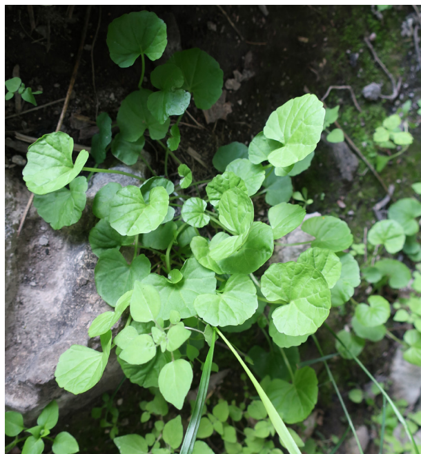
Figure 2. Megadenia speluncarum Vorob., Vorosch. & Gorovoj at the Vitiaz' bay (Russian Far East, Primorskiy kray) aside the road between Alexeevka and Vitiaz', in shady broad-leaved forest, near the brook, June 2018.

speluncarum ). Later the taxonomic status of these species was evaluated, and all three species, due their high morphological similarity, were synonymized as Megadenia pygmaea (Berkutenko, 1998; Zhou et al., 2001; Ostroumova and Berkutenko, 2010). Finally, detailed research, using molecular methods, allowed Artyukova, Kozzyrenko, and Gorovoy (2014) to restore the species status for Megadenia speluncarum . Their data on the plastid genome revealed a clear subdivision of the genus into three lineages matching the three described species.