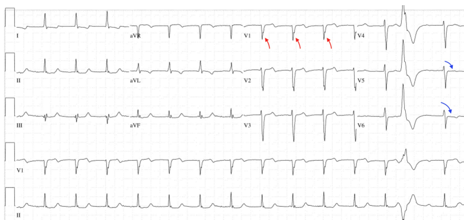
FIGURE 2: Electrocardiography

On day 2 of hospitalization, a code blue was activated due to the sudden onset of pulseless electrical activity (PEA) arrest as the patient was found to be unresponsive in bed. He was hemodynamically stable and saturating well on room air prior to the code activation. He also denied chest pain, diaphoresis, or dyspnea. Emergent high-quality cardiopulmonary resuscitation (CPR) began according to the advanced cardiovascular life support (ACLS) protocol as the return of spontaneous circulation (ROSC) was later achieved. The patient was intubated, sedated, and transferred to the cardiac surgical unit (CSU) for further management. EKG during the code blue revealed findings that were concerning for anterolateral myocardial infarction (Figure 2). The patient was taken to the cardiac catheterization laboratory for an urgent exploration of the coronary arteries as troponin levels were trending upwards to possibly explain for the PEA arrest. Catheterization showed patent bypass grafts along with a hyperdynamic left ventricular systolic function. He remained to be stable overnight.