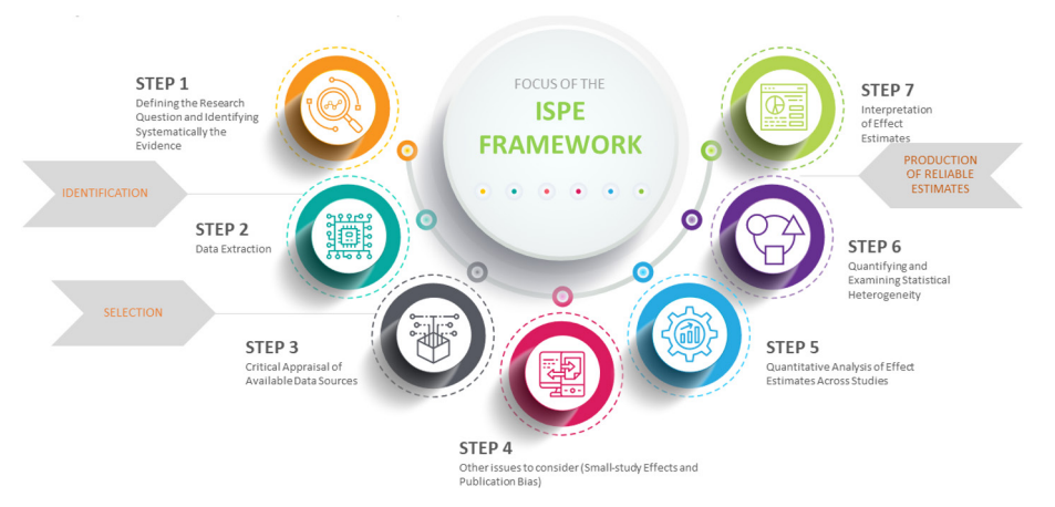
Figure 1 International Society for Pharmacoepidemiology (ISPE) CER SIG framework for combining NRS with RCTs. CER, comparative effectiveness research; NRS, non-randomised studies; RCT, randomised controlled trial; SIG, Special Interest Group.

ISPE endorsed publications) and publications from selected journals (such as Clinical Pharmacology and Therapeutics, Research Synthesis Method and Statistics in Medicine).