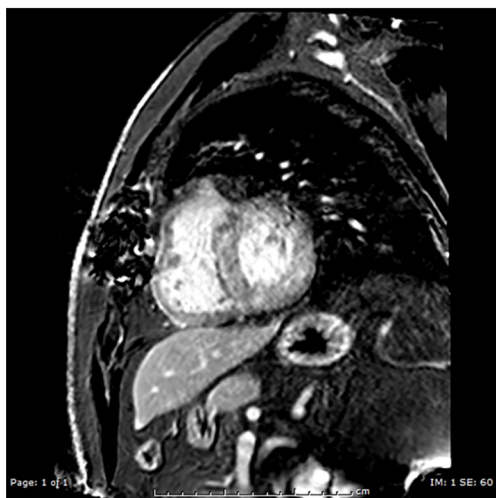
Figure 2 Characteristic late gadolinium enhancement with phase-sensitive inversion recovery sequence shows diffuse subendocardial enhancement that is evenly distributed throughout the left ventricular wall.

( Figure 1 ) and normal functioning bioprosthetic aortic valve. Brain natriuretic peptide was not obtained at that time as patient did not appear volume overloaded on exam and by Echo. Based on the clinical presentation of