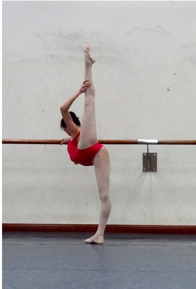
(xiv) A student at the Shanghai Dance School stretching during morning drills, June 2016

The teacher resembled a drill sergeant barking instructions, and a near constant commentary on the students' performances and physical characteristics. "Jump higher! Higher! Wider legs! HIGHER! Good. Jump.! Jump! Jump higher!". Despite the obvious effort, the students are red faced and dripping with sweat, they do not utter a single sound. The dancer's body, her muscles, joints, bones are fatigued, her lungs pounding in her chest, screaming at her to stop. However, it is in reaching this space of near maximum effort, of pushing the boundaries of what feels physically possible, that the dancer is honing and expanding her abilities. I was told by many students that the teacher only attends these drills for the first year or two of training. In the third year, the assigned Class Monitor put the class through their paces. The teacher threatens to attend in random spot checks. There is danger of punishment if the students do not attend this session or perform poorly with minimal effort. It is unlikely that students will fail to work to their full potential or change themselves. The voice of the teacher shouting instructions in the first and second year,