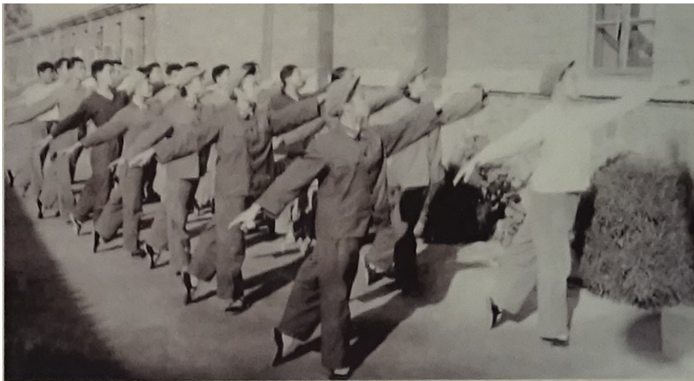
(vi.) Taking company class in Datong Military Camp, August 1964 (National Ballet of China Archives, © National Ballet of China).

To return to the Foucauldian analysis introduced in chapter one, the use of the army training by the dance unit is interesting in order to understand the strategic deployment of dancers by the CCP during the Maoist era. In examining the Hainan Island training of the dancers, it is possible to draw striking parallels with Foucault's analysis of the creation of docile bodies outlined in Discipline and Punish (1979 [1975]). In Foucault's work, a