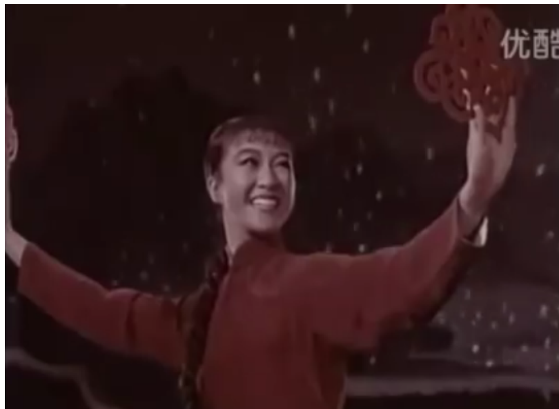
(ix.) An example of a shan bang [山膀] arm position in The White Haired Girl (1972, dir. Sang Hu)

The movement of the ballet too, mirrors the fusion of Western forms with native genres. In the opening scene of the ballet Xi'er is decorating her humble home with Chinese papercutting for the upcoming Spring Festival. Although dressed in red Chinese pyjamas, her light, delicate solo constituting low posé passé into small développé devant is reminiscent of Giselle's carefree entrance in the eponymous ballet. Both simple peasant girls, Giselle and Xi'er dance with youthful abandon in front of their homes in the comfort of their native village setting. However, in The White Haired Girl some the classical lines are somewhat modified. Classical, externally rotated arm position are swapped for the inwardly rotated forearms with outward facing palms known as shan bang [山膀] commonly seen in Chinese dance.