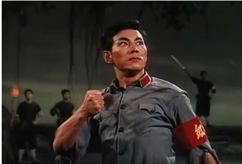
(vii.) An example of a 'frozen pose' in Red Detachment of Women (1970), dir. Pan Wenzhan, Fu Jie.