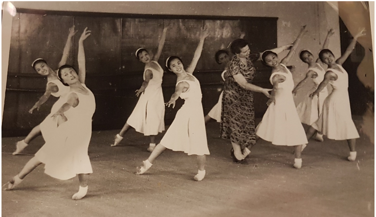
(ii.) Ballet class at Beijing Dance School, 1957

Bolshoi training". This Soviet style identified by Rambert in the photograph can be seen through the very expansive sense of allongé in the port de bras, the external rotation on the standing leg, and the in the alignment of the dancers positioned with a much more extreme sense of croisé than might be observed in dancers trained in other parts of Europe 14 .