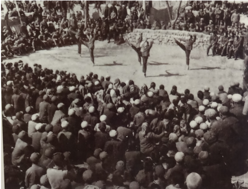
(viii.) Dancers performing outside in the countryside, 1968.

For most of the villagers, this was their first encounter with classical ballet. The revolutionizing of the form following the ‘three processes of transformation’ and the ‘three prominences’ made the ballet accessible to naïve audiences, and was very successful. “In every town 20,000 to 30,000 people sat below the stage and watched us perform in the freezing cold weather . . . It was all outdoors in the light of day.” (Zhao in Young 2011: CBS News)