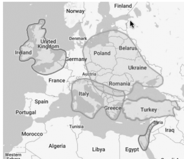
FIGURE 2: FAMILYTREEDNA 80

DNA ancestry tests can also report an individual's relationships to their genetic family members. 81 For example, AncestryDNA users not only gain access to information about their genetic ancestry (expressed in geographical terms) but also the ability to match with other users to whom they may be genetically related. 82 Using this technology, one of the authors of this Essay located her genetic cousins. She had never met some of her matches because her father was adopted. The website compared her genetic data to that of its database and found enough genetic similarity to hypothesize that she and two other users were long-lost genetic relatives.