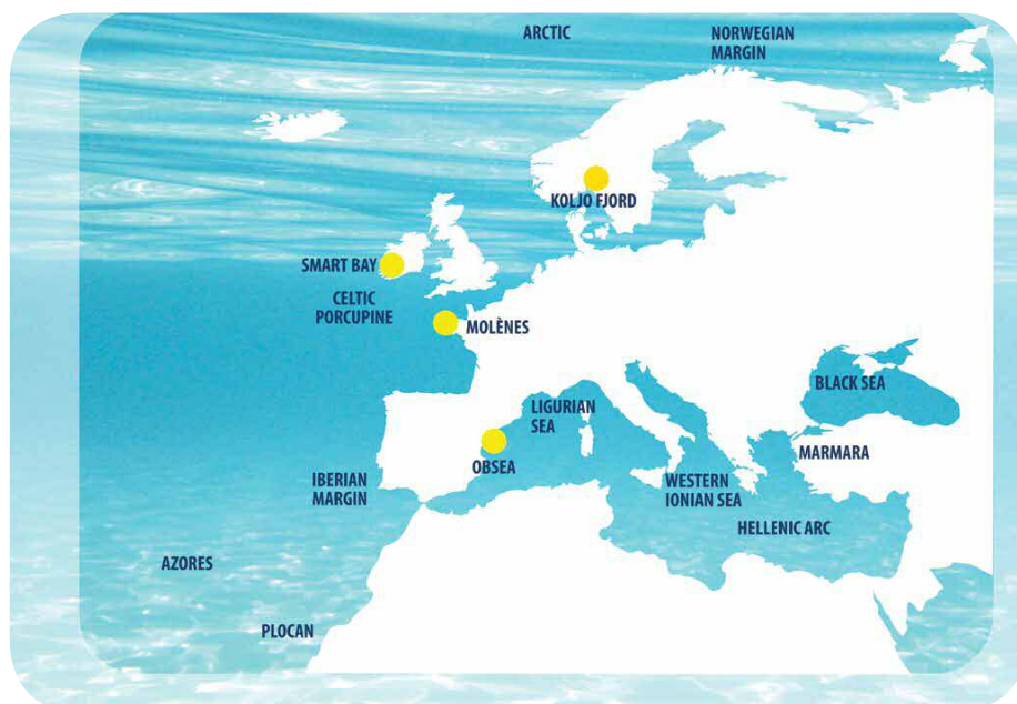
Figure 1. Map of current EMSO nodes. Yellow dots indicate testbeds.

Turkey, Germany, and the Netherlands. Participation is open to all (both individual scientists and institutions), and will be coordinated through an association called ESONET-Vi (European Seafloor Observatory NETwork—The Vision), following the extensive scientific community planning