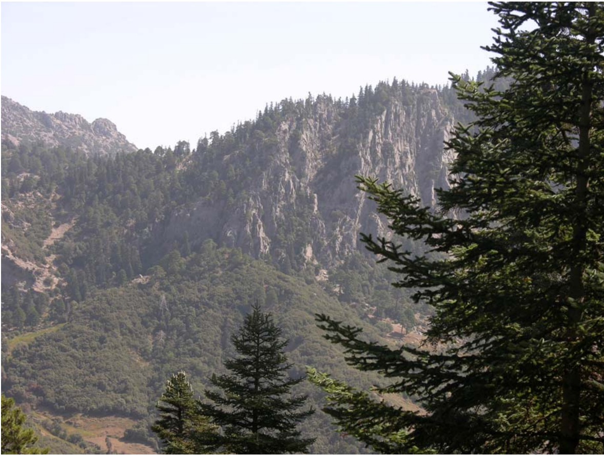
Fig. 1. Abies maroccana population at Rif Mountains (Jbel Lakraa, Morocco).