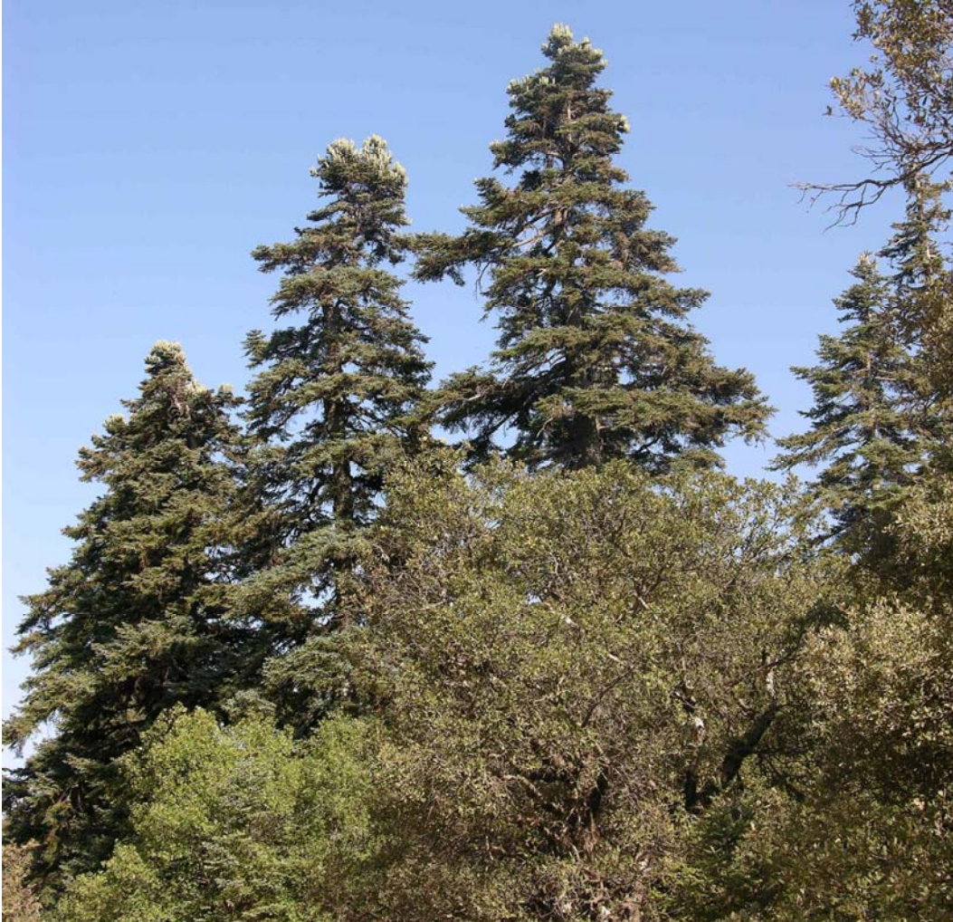
Fig. 2. Abies tazaotana at Rif Mountains (Jbel Tasaot, Morocco) with the cones at the top of the trees.