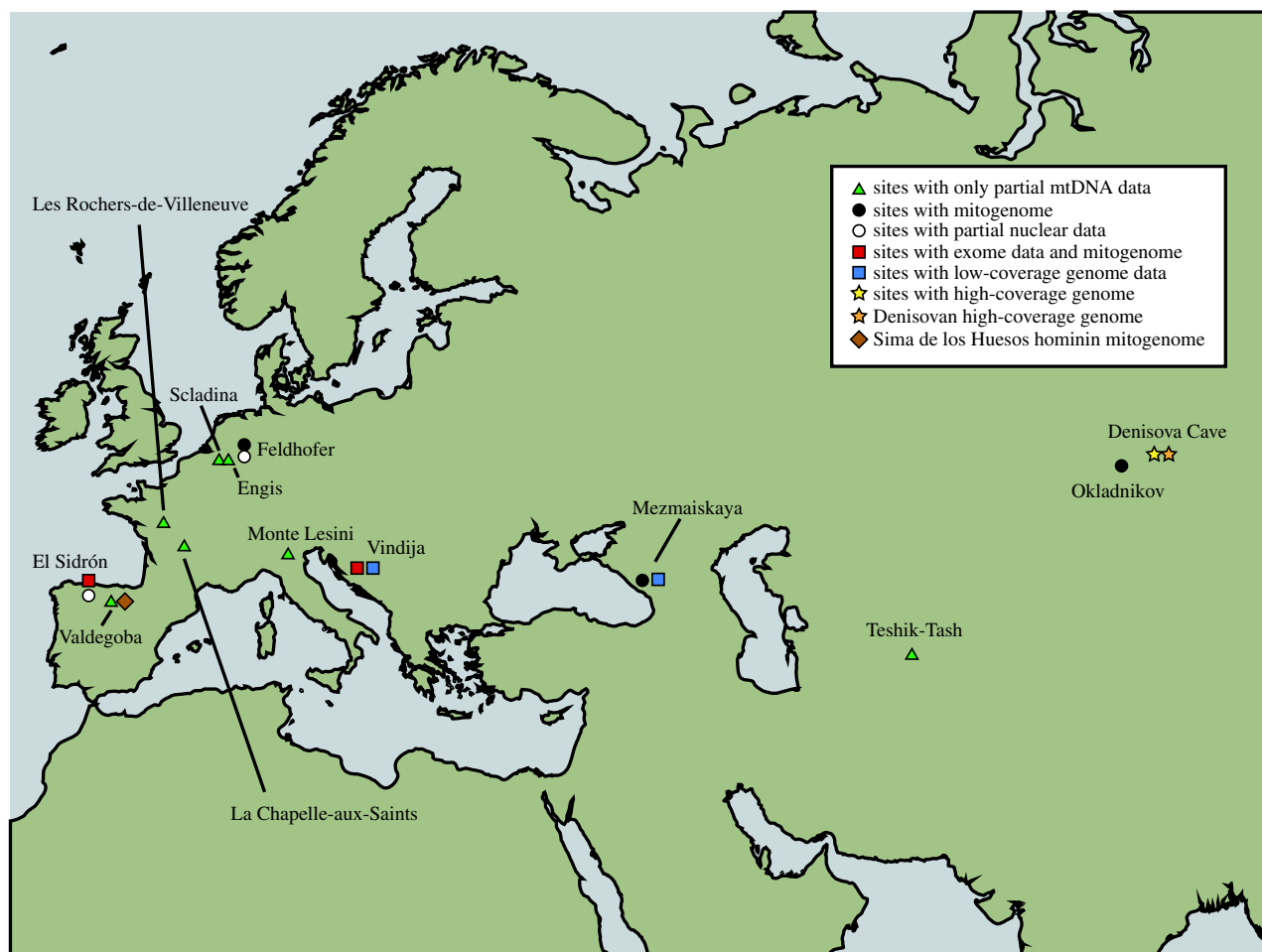
Figure 1. Geographical map showing Neanderthal and Denisovan sites with different types of genetic data (partial mitochondrial, complete mitogenomes, exomes, partial nuclear data or complete genomes) retrieved.

specimen from Feldhofer cave in Germany. By comparing it against a panel of worldwide present-day human mtDNA sequences, the data indicated that Neanderthals were a sister group to anatomically modern humans, providing no evidence of interbreeding between Neanderthals and modern humans, at least to a level sufficient to result in Neanderthal mtDNA introgression into the modern human mtDNA gene pool [1].