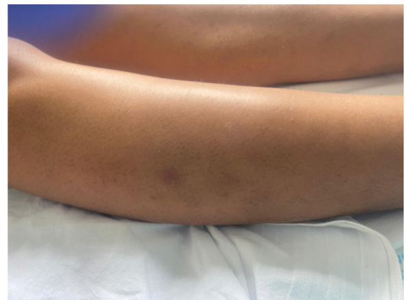
Figure 1 Nodular lesion (2 cm in diameter) with a brownish surface located on the outer aspect of the right leg.

Eosinophilic panniculitis is a very rare form of panniculitis. It affects women more frequently than men (3:1 ratio), and its incidence peaks in the third and sixth decades of life. 2 It is a reactive process secondary to a range of stimuli,