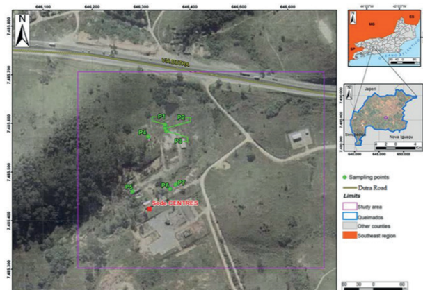
Fig. 1. Sampling sites (P1 to P7) location in the CENTRES area, Rio de Janeiro State, Brazil.

Seven samples of surface soils (0-10 cm) from the CENTRES storage area were collected in triplicate (samples P1 to P7; Fig. 1 ). To evaluate a possible migration of metal pollutants into deeper soil layers, additional triplicate samples were collected from two subsurface depth intervals (10-20 and 20-30 cm) from the last three sampling stations mentioned above. These subsurface samples were identified as P5.1, P6.1 and P7.1 (10-20 cm) and P5.2, P6.2 and P7.2 (20-30 cm). Soil sampling was carried out following the procedures suggested by the Brazilian Society of Soil Sciences (Santos et al. 2013). All samples are characterized as urban soils, except for P4, which was chosen as control, considering its location at a more elevated position without exposure to hazardous materials.