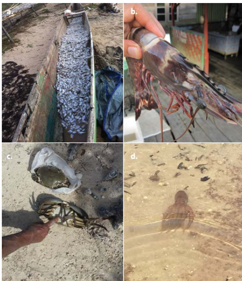
Figure 3 Examples of coastal wetland organisms used for food, including dried fish in Sulawesi, Indonesia (a); prawns in Sumatra, Indonesia (b); mangrove crabs in New Caledonia (c); and octopus in Madagascar (d).

valued at over USD $1,000 ha -1 yr -1 for fisheries alone (De Groot et al. 2012, Costanza et al. 2014). In many instances, the abundance and exploitation of food resources creates a number of livelihood opportunities (Siar 2003, Glaser & Diele 2004, Magalhães et al. 2007; Figure 3).