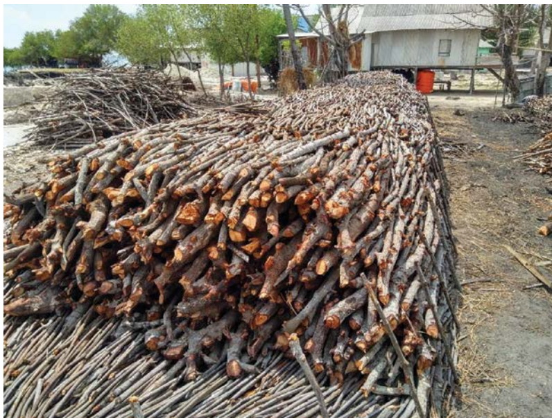
Figure 2 Local-scale mangrove harvesting for charcoal, Tanakeke Island, Indonesia.

became part of the tax or ‘tribute’ that indigenous communities had to pay the Spanish king (López-Angarita et al. 2016). Today, some small-scale charcoal production is conducted at the community level, which can have negative impacts on local mangroves if not regulated effectively (Brown et al. 2014; Figure 2). Most charcoal production, however, is produced through large forestry concessions, with complex supply chains that produce charcoal for national and regional markets. For example, Matang Mangrove Forest Reserve in Malaysia has been managed for forestry purposes since 1902, and produces as much as 179 tonnes of biomass per hectare each year from harvested plots (Ismail et al., 2017). Forestry production in Matang is not without consequence, however, as species diversity and wood yields have declined over time (Goessens et al. 2014).