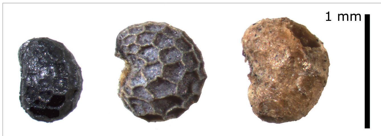
Fig. 2. Seeds of Papaver somniferum , poppy, preserved by charring (left) and by dessication (centre and right) from Cueva de Los Murciélagos (Zuheros, Córdoba).

Despite the main element of the food producing economies were cultivated plants, wild species kept to be exploited adding diversity to subsistence. For other areas such as the Near East, archaeobotanical studies (Fairbairn, 2007) have demonstrated the collection and processing of wild seeds. Examples from Europe are also abundant (e.g. Jones, 2000). The available evidence from plant remains for the western Mediterranean has been traditional limited, mainly consisting of the presence acorns, hazel nuts and in few cases of wild Prunus fruits. However, fresh data from northern Morocco (Morales et al., 2013) reveals an extraordinary rich assemblage (more than 7000 remains) including different taxa which suggest the importance of gathering in these communities. Seeds of the mastic tree ( Pistacia lentiscus ) are the most abundant but there are also many other species such as the dwarf palm ( Chamaerops humilis ) or the juniper ( Juniperus phoenicea ) are common. Plant groups such as the wild legumes, particularly Vicia and Lathyrus spp. are frequent while other food species such as Quercus and Olea are less common (Morales et al., 2013). Interestingly, a common macroremain is represented by the aerial rhizome of alfa grass ( Stipa tenacissima ).