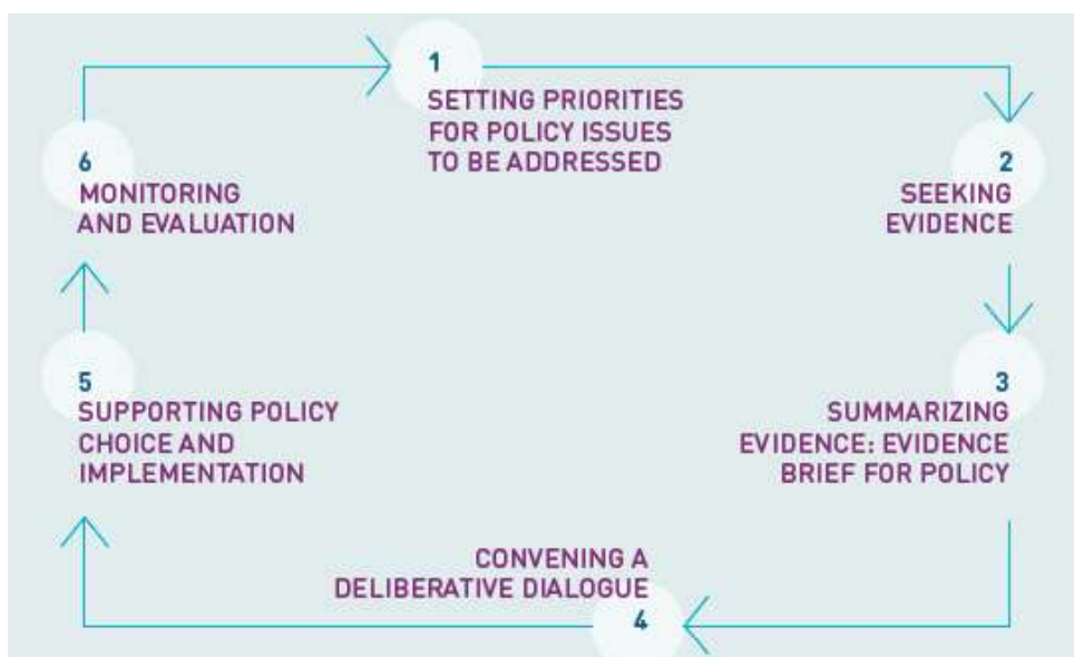
Fig. 1. EVIPnet action cycle

Over the past few years, increased international attention has been paid to bridging the gap between health research and policy-making. In 2005, the World Health Organization (WHO) launched the Evidence-informed Policy Network (EVIPNet) as a mechanism to strengthen the research–policy interface. EVIPNet’s goal is to improve public health and reduce inequities by increasing the systematic use of the best available scientific evidence to guide development of health systems policy. In October 2012, a regional EVIPNet was launched in the WHO European Region. It promotes the systematic use of health research evidence in policy-making and aims to build capacity in countries to develop policy briefs and establish mechanisms to translate evidence into policy (Fig. 1). Poland joined the Network in 2013, while its formal launch took place in 2015 in Warsaw at a workshop attended by key policy-makers, researchers and other stakeholders (EVIPNet Europe, 2015).