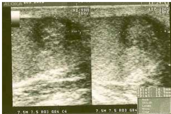
Fig. 1. A heterogeneous heteroechoic formation of 14×10.9×13.4 mm in the upper pole of the right testicle with a clear, even contour.

days in the consultative polyclinic of Saransk Children's Republican Clinical Hospital, the formation was detected, a second ultrasound of the scrotum was performed, in which no dynamics was observed (Fig. 1). Ultrasound examination demonstrated a chronic non-calculous cholecystitis.