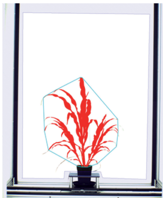
Figure 1 - Algorithm output example (in red the selected plant image is visible as an overlay).

The conversion of the images to digital phenotypes was executed through the use of image analysis algorithms. A pixel based value predictive of the size of the plant per side and top image per plant per day was calculated (exemplified in Figure 1), to provide an overall measure of the above ground fresh green shoot size (defined as the variable "Area"). It was derived integrating the four side view images taken per plant per day. Means and standard errors of final size of the plant (area, in pixels) were calculated per day of the experiment. An analysis of variance was performed per day of the experiment, taking "Genotype" as a fixed factor and assuming a completely randomized design. Least significant differences per day ( P=0.05 ) were derived from these analyses of variance. Mid-parent heterosis (MPH) and high parent heterosis (HPH) for variable "Area" were calculated.