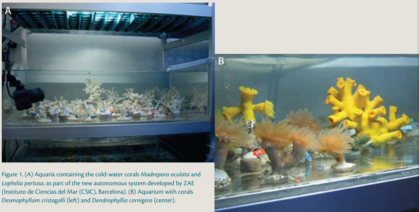
Figure 1. (A) Aquaria containing the cold-water corals Madrepora oculata and Lophelia pertusa , as part of the new autonomous system developed by ZAE (Instituto de Ciencias del Mar (CSIC), Barcelona). (B) Aquarium with corals Desmophyllum cristagalli (left) and Dendrophyllia cornigera (center).

The water in each aquarium is recirculated through the submerged pumps (RP), which homogenize the water masses and generate currents—essential for the corals. To avoid overflow, each aquarium is equipped with an outlet to expel the excess water to TA2 when it exceeds the maximum level. In the same way, TA2 is provided with an outlet to eject excess water, as well as an electric pump (P2), which discharges the surplus water to TA1 after passing through a biological filter that eliminates suspended particles.